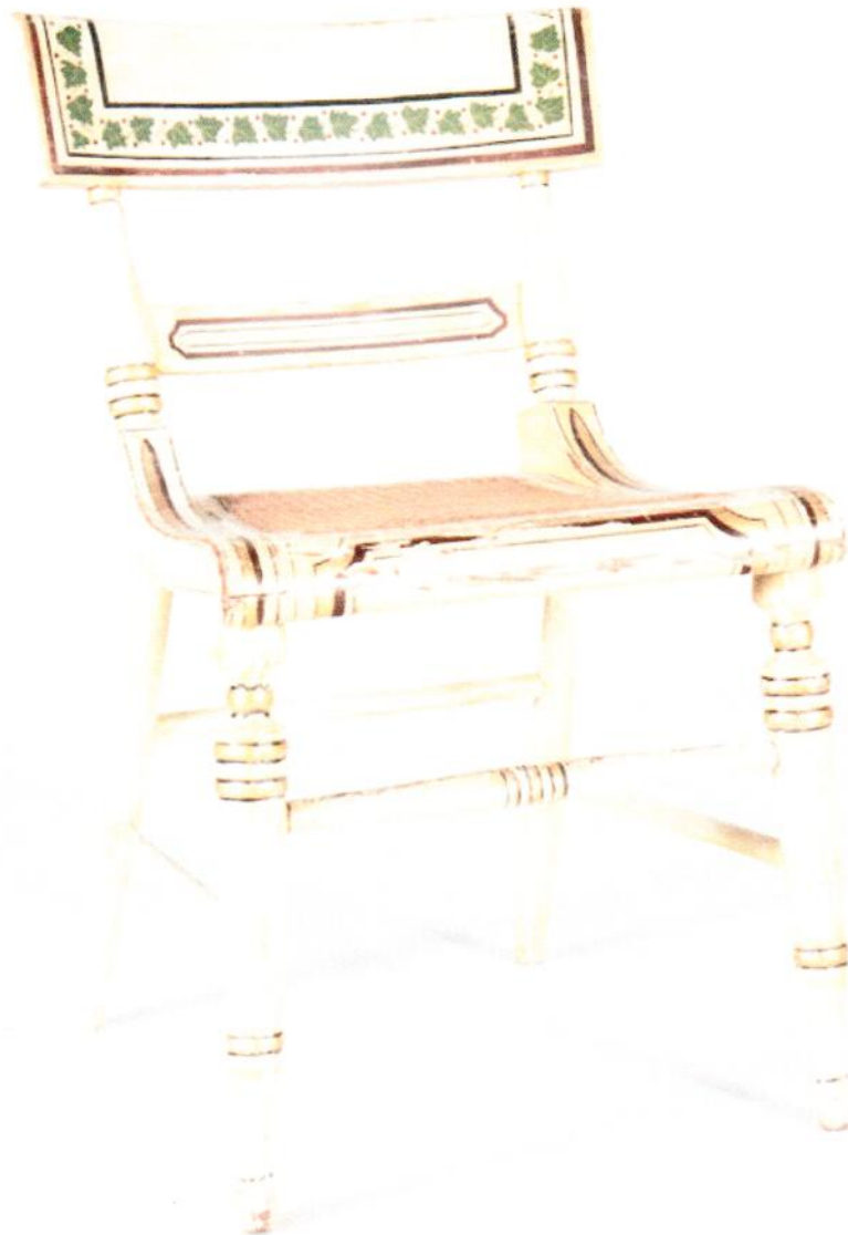
Federal Painted and Caned Fancy Chair. Baltimore. 30 1/2 height, 18 3/4 width, 18 deep inches. Stair Galleries.

Ten Great American Painters and Their Brilliant Rivals • Questroyal Fine Art, 903 Park Avenue, New York, NY • to March 28 • questroyalfineart.com ( https://www.questroyalfineart.com/ ).