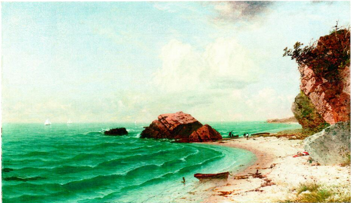
New England Coastal Scene with Figures by John Frederick Kensett, 1864. Oil on canvas. 14 1/4 by 24 3/16 inches. Questroyal Fine Art.