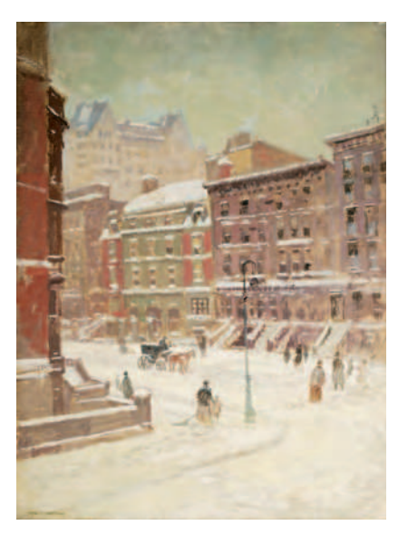
Paul Cornoyer (1864–1923) New York City View in Winter Oil on canvas 24<sup>1</sup>/4 x 18<sup>1</sup>/4 inches Signed lower left: PAUL CORNOYER