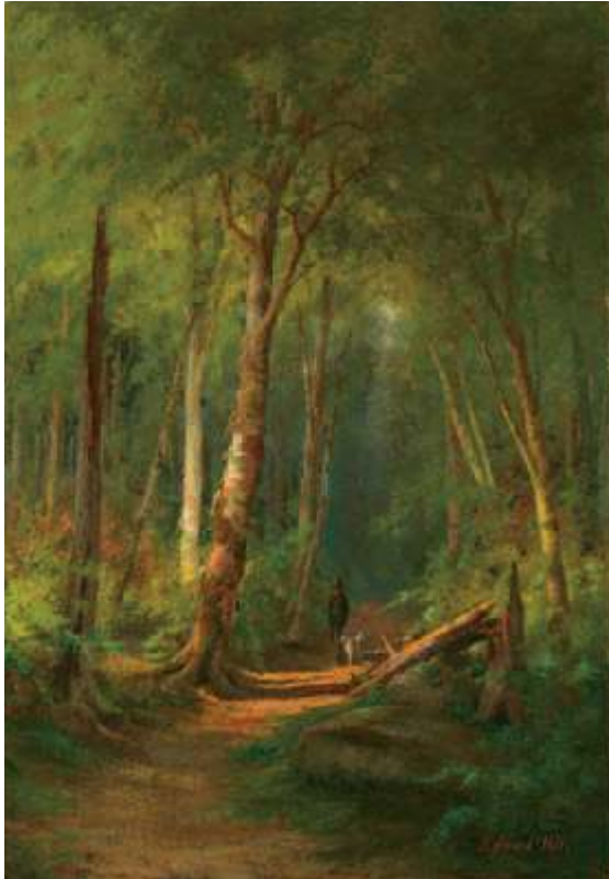
Edward Hill (1843–1923) Hunter with Dogs Oil on canvas 20 3 / 16 x 14 1 / 4 inches Signed lower right: Edward Hill .