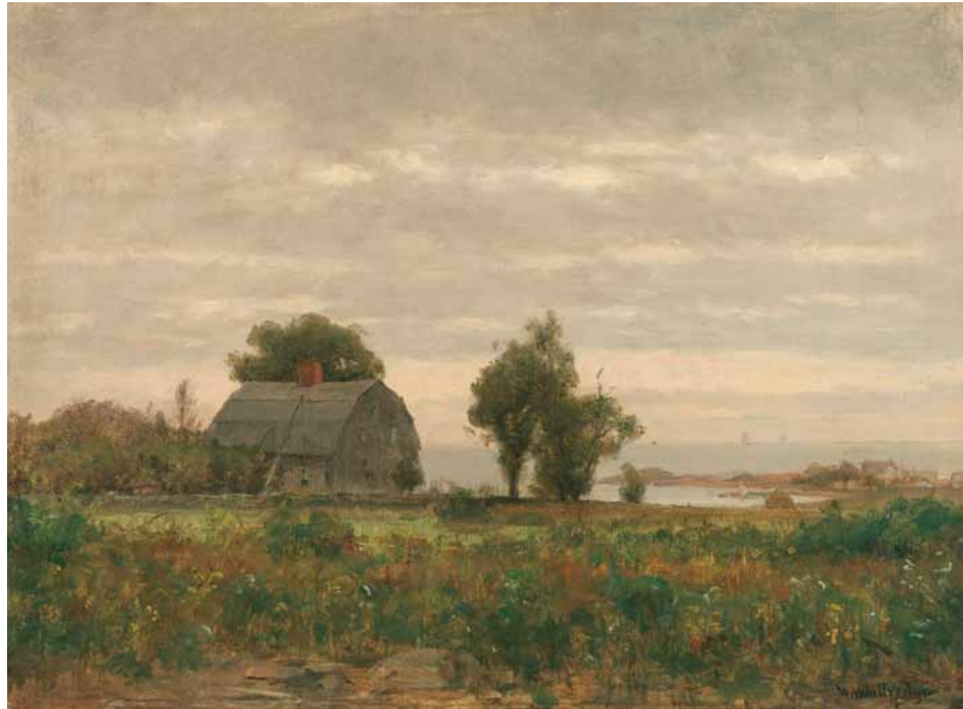
T. Worthington Whittredge (1820–1910) An Old Colonial House Oil on canvas 12 9 / 16 x 16 9 / 16 inches Signed lower right: W. Whittredge ; inscribed on verso: An Old Collonial [sic] House