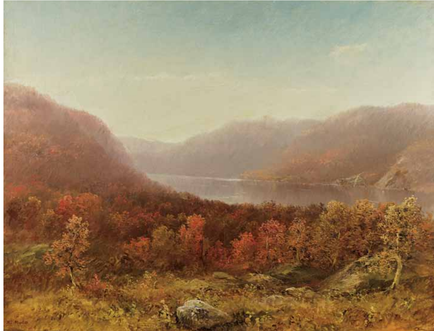
Homer Dodge Martin (1836–1897) Highlands on the Hudson Oil on canvas 20 1 / 8 x 26 1 / 8 inches Signed lower left: H. D. Martin