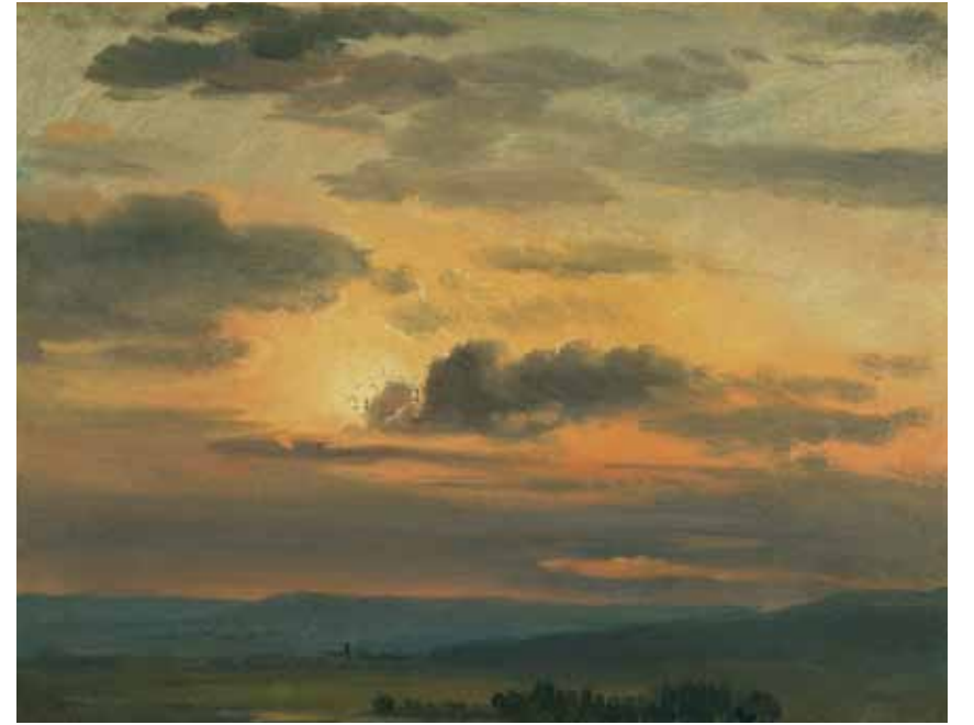
William Bradford (1823–1892) Golden Sunset Oil on canvas 10 1 / 8 x 12 15 / 16 inches