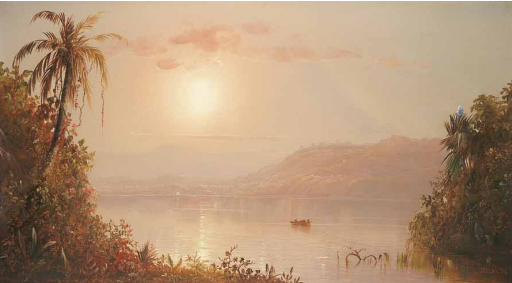
Norton Bush (1834–1894) Gatun Lake, Panama , 1879 Oil on canvas 20 1 / 8 x 36 1 / 8 inches Signed and dated lower right: NBush. 79.