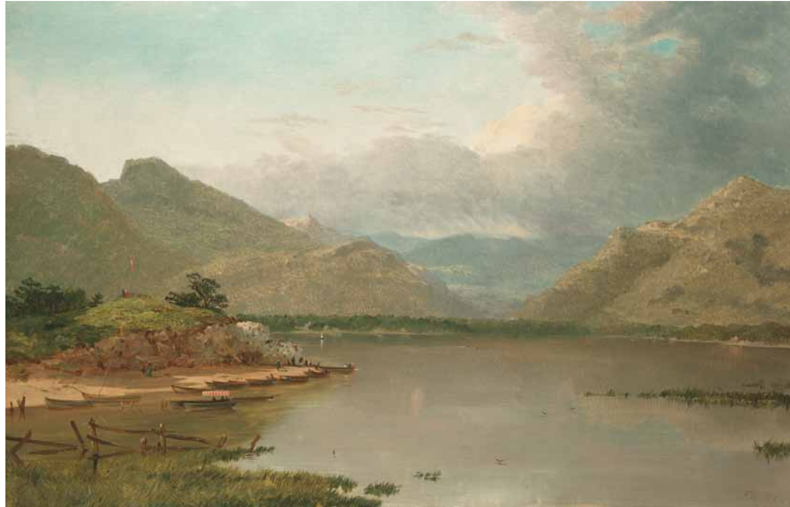
John Frederick Kensett (1816–1872) Killarney Lakes , 1858 Oil on canvas 20 x 30 1 / 4 inches Monogrammed and dated lower right: JF K. 58.