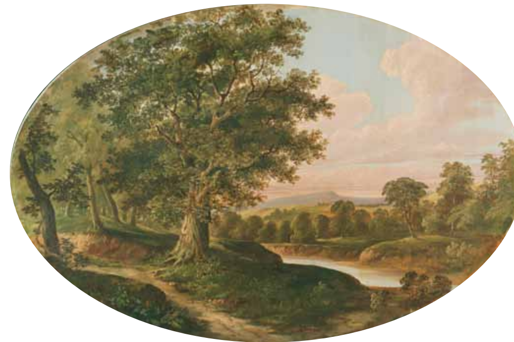
Andrew Andrews (ACTIVE 1847–1853) View near Albany Oil on canvas Oval 24 x 34 inches Signed lower right center: A. Andrews