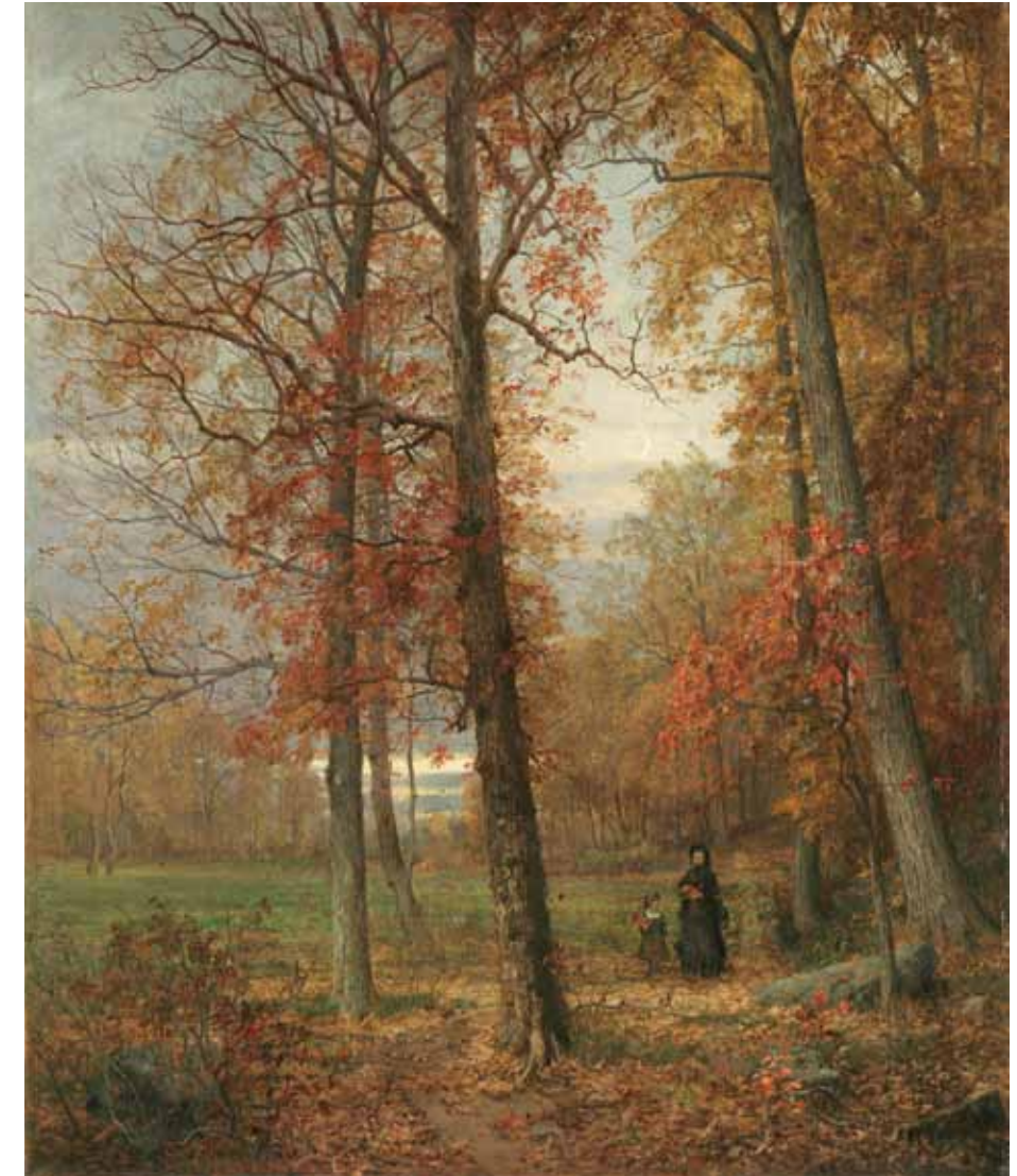
William Trost Richards (1833–1905) Mother and Child in an Autumn Landscape , 1876 Oil on canvas 24 1 / 4 x 20 3 / 8 inches Signed and dated lower left: Wm T. Richards. 1876.