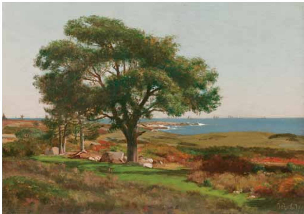
Jervis McEntee (1828–1891) Near Kennebunkport, Maine, 1877 Oil on canvas 11 3 / 8 x 16 1 / 8 inches Dated lower right: Oct 6. 77. ; inscribed on verso: Near Kennebunkport 11167