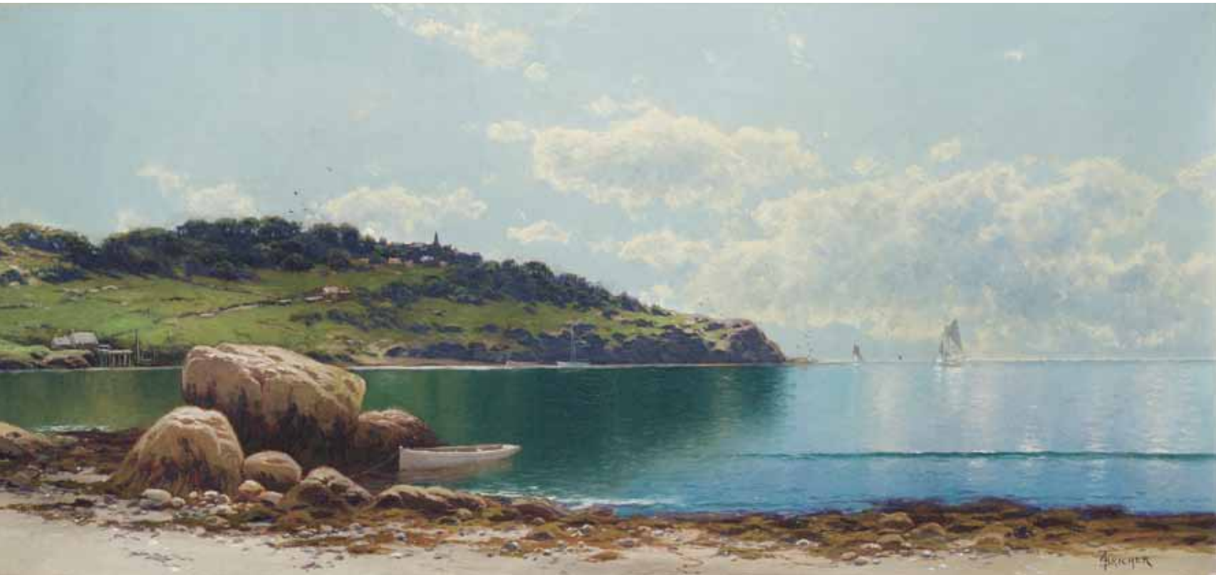
Alfred Thompson Bricher (1837–1908) Seascape Oil on canvas 17 1/8 x 36 1/8 inches Monogrammed lower right: ATBRICHER