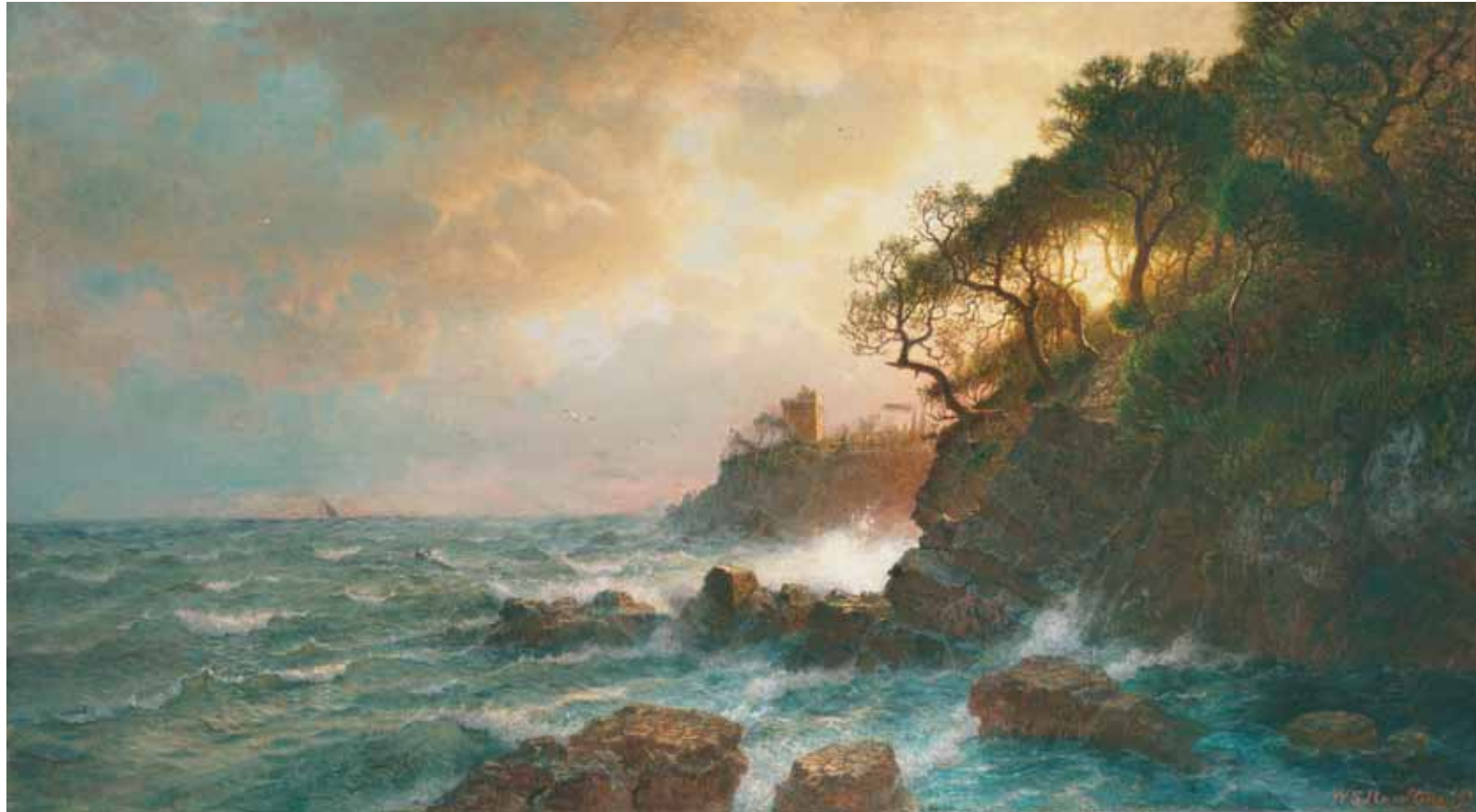
William Stanley Haseltine (1835–1900) Coast of Sori , 1893 Oil on canvas 25 3 / 16 x 45 5 / 16 inches Signed and dated lower right: W. S. Haseltine '93