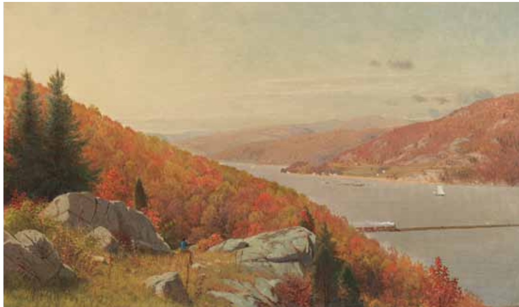
Frank Anderson (1844–1891) Hudson River View in Autumn, 1867 Oil on canvas 11 1 / 4 x 18 3 / 4 inches Signed and dated lower left: F.ANDERSON / 1867