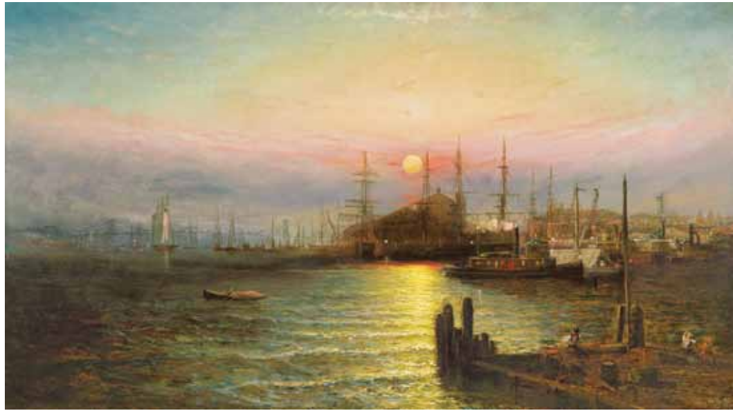
Elisha Taylor Baker (1827–1890) East River Scene, Brooklyn, NY, c. 1886 Oil on canvas 18 1 / 8 x 32 1 / 8 inches Signed and dated lower right: E Taylor B 188 [illegible]