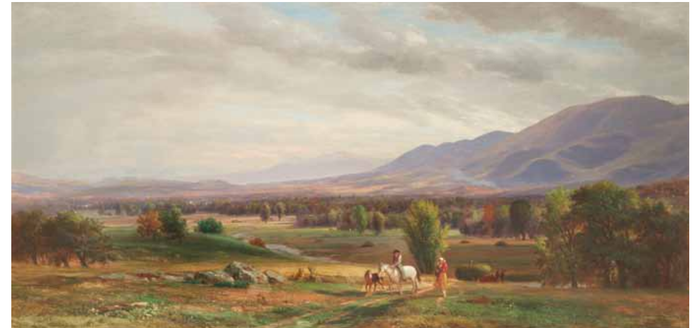
Samuel Lancaster Gerry (1813–1891) View of the Valley Oil on canvas 24 1 / 8 x 48 3 / 16 inches Signed lower right: S.L. Gerry