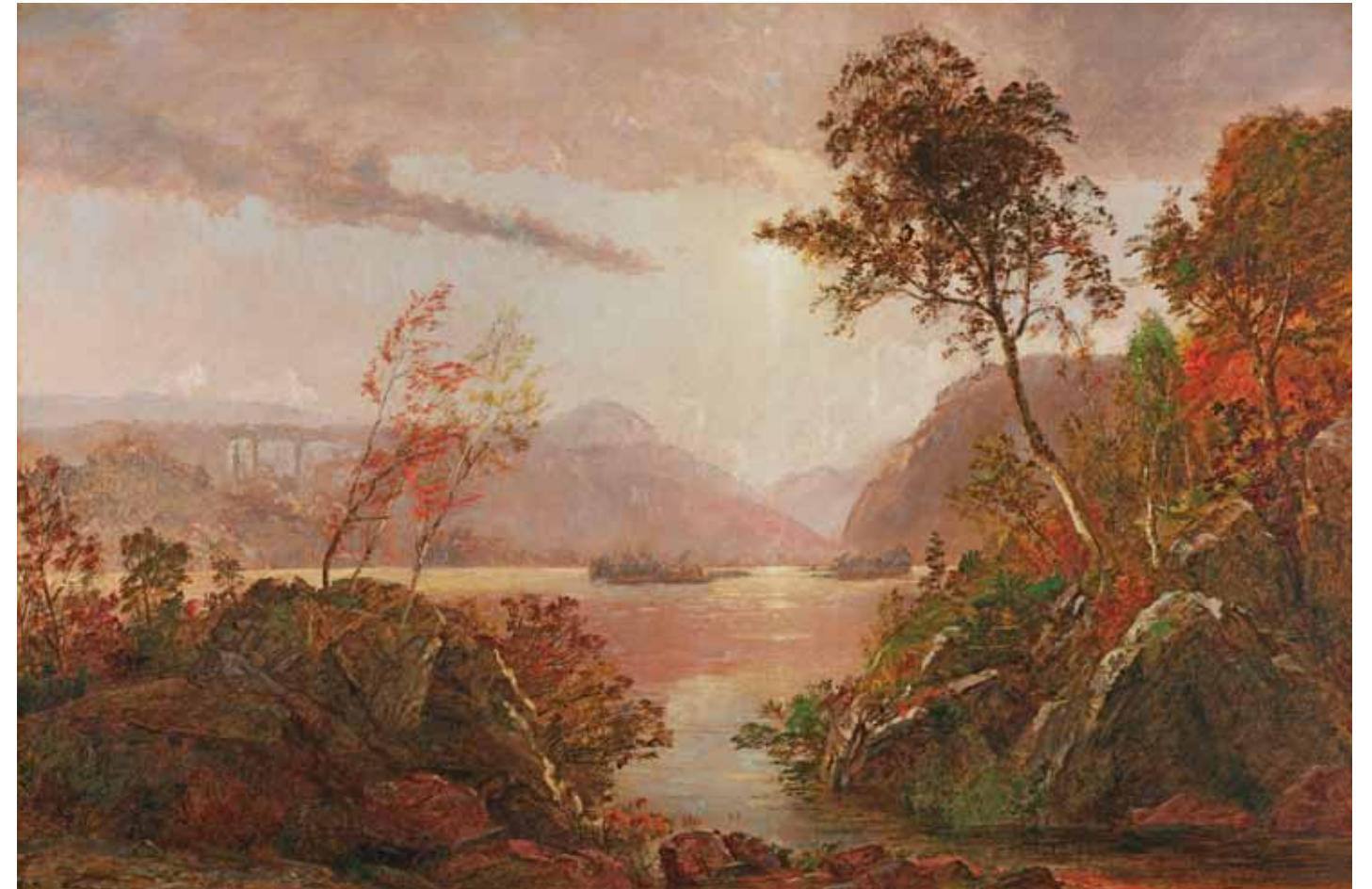
Jasper Francis Cropsey (1823–1900) Gates of the Hudson Oil on canvas 20 1 / 4 x 30 5 / 16 inches Signed lower left: J.F. Cropsey