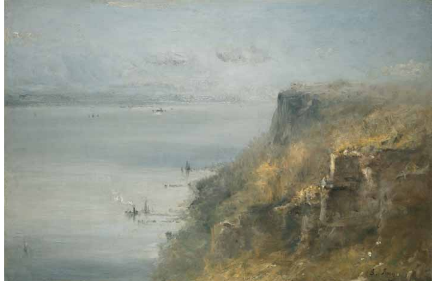
George Inness (1825–1894) Palisades on the Hudson Oil on canvas 20 1 / 8 x 30 1 / 8 inches Signed lower right: G. Inness