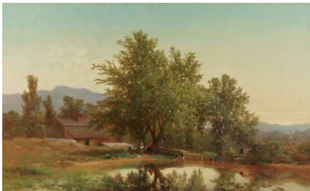
Albert Fitch Bellows (1829–1883) Landscape with Pond, 1862 Oil on canvas 13 1 / 8 x 21 3 / 16 inches Signed and dated lower left: A. F. Bellows / 1862