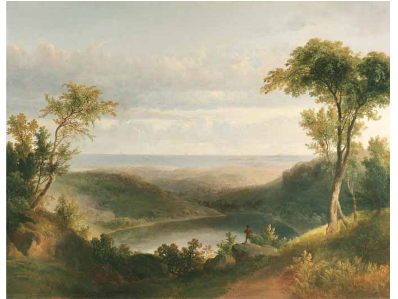
Thomas Doughty (1793–1856) Seacoast Oil on canvas 22 5/16 x 28 1/2 inches Signed lower left: T. Doughty.