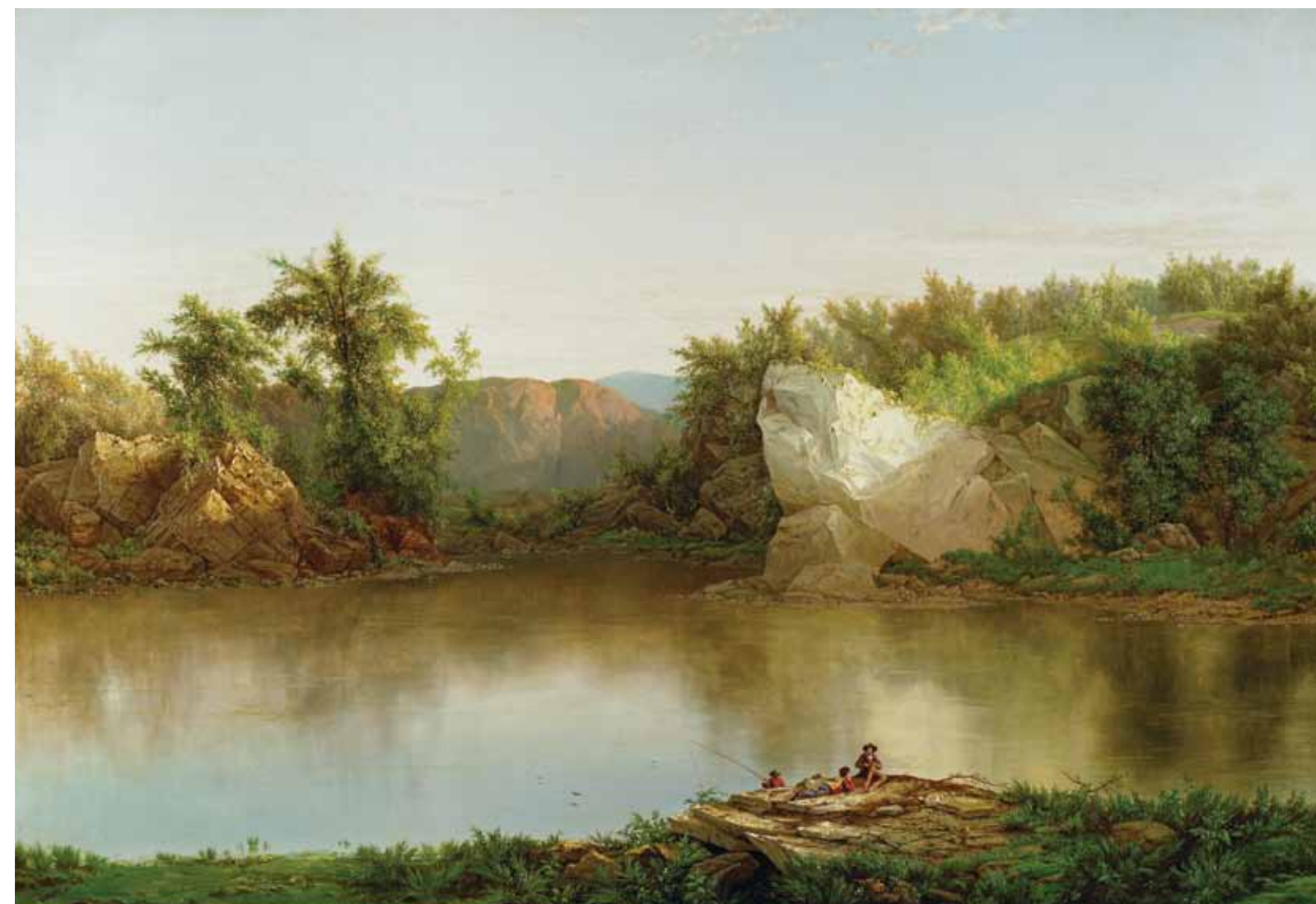
William Mason Brown (1828–1898) Landscape with Figures Oil on canvas 22 1 / 4 x 32 5 / 16 inches Monogrammed lower left: WMB.