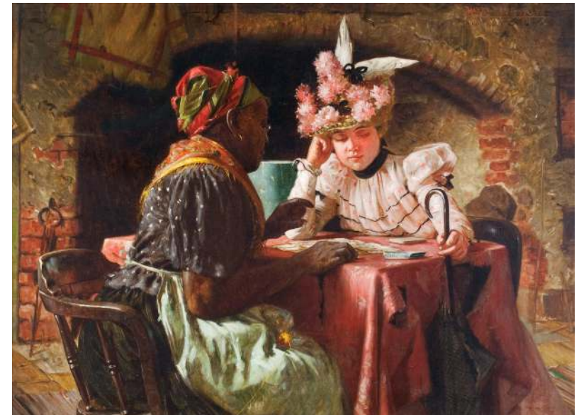
Harry Roseland (1866–1950) Looking into the Future , 1899 Oil on canvas 18 1/8 x 24 1/8 inches Signed and dated upper right: HARRY ROSELAND. / .99