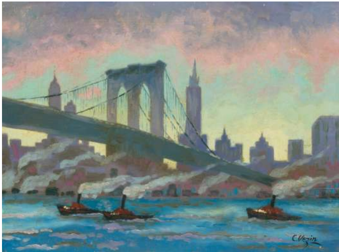
Charles Vezin (1858–1942) Brooklyn Bridge Oil on board 10 15 / 16 x 15 1 / 16 inches Signed lower right: C. Vezin