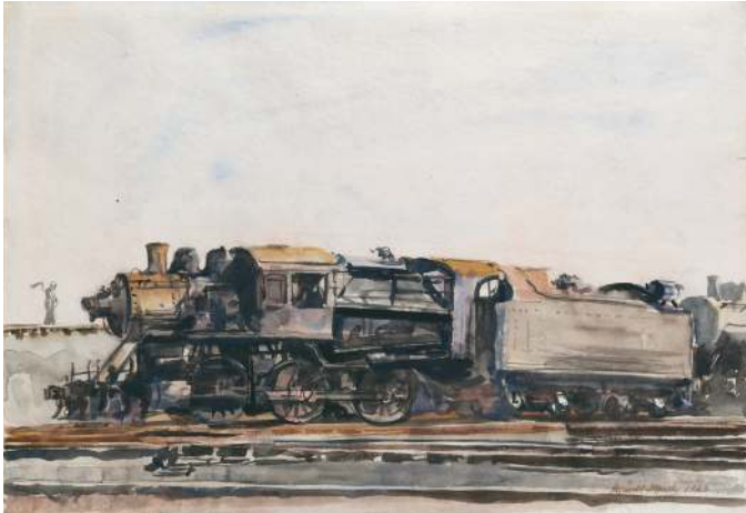
Reginald Marsh (1898–1954) Locomotive , 1929 Watercolor and pencil on paper 13 15 / 16 x 20 inches Signed and dated lower right: Reginald Marsh 1929