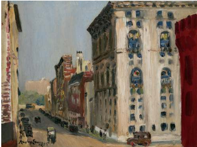
Hayley Lever (1876–1958) 66th Street, Looking West, New York , 1935 Oil on board 8 7/8 x 11 7/8 inches Signed and dated lower left: Hayley Lever 35 ; on verso label: 66th St Looking West. / Park Ave Corner Hayley Lever. / New York 1935