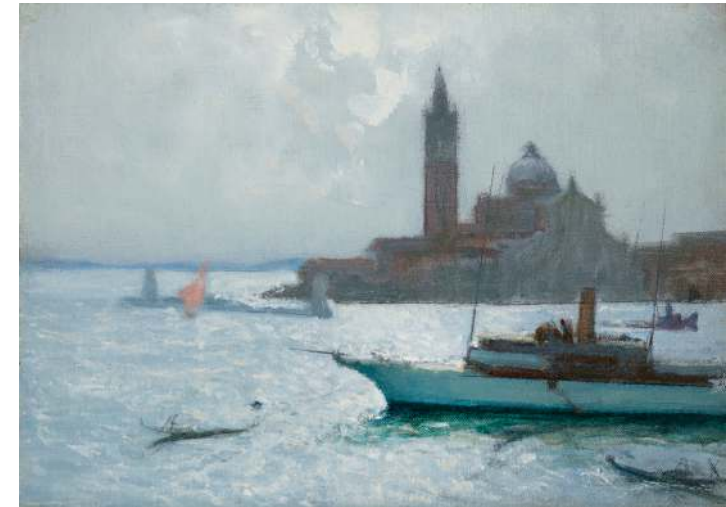
Charles H. Chapin (1830–1889) Landscape Oil on canvas 12¼ x 20¼ inches Signed lower left: C. H. Chapin.