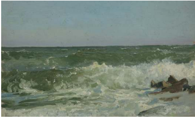
William Trost Richards (1833–1905) Coastal View with Rocks Oil on board 5½ x 9¼ inches