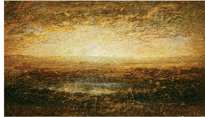
Ralph Albert Blakelock (1847–1919) Sunset on the Marsh Oil on canvas 4 x 6⅝ inches Signed lower right in arrowhead: R. A. Blakelock