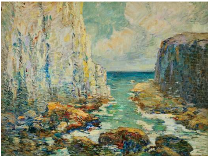
Paul King (1867–1947) Isles of Shoals Oil on canvas laid down on board 11 7 / 8 x 16¼ inches Signed lower left: PAUL KING