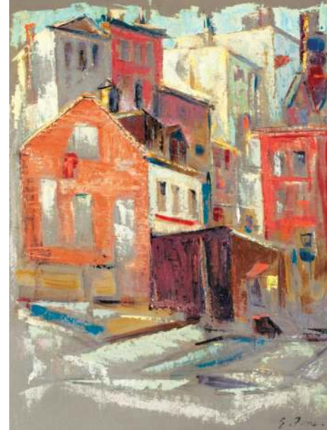
Ernest Fiene (1894–1965) New York City Scene Oil on canvas laid down on board 24 5/8 x 18 3/8 inches Signed lower right: E. Fiene.