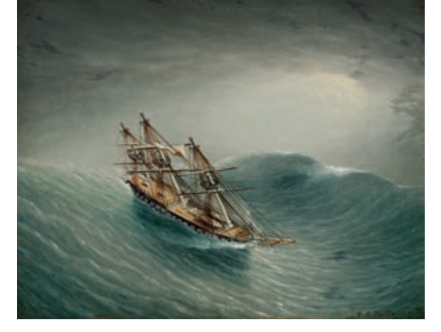
James E. Buttersworth (1817–1894) Schooner in a Stormy Sea Oil on board 7<sup>7</sup>/8 x 10<sup>1</sup>/16 inches Signed lower right: J E Buttersworth