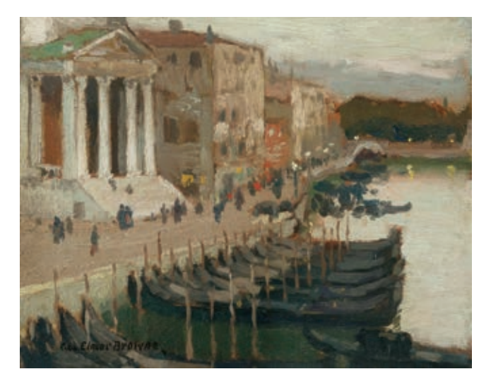
George Elmer Browne (1871–1946) Evening in Venice Oil on board 10^{1/2} \times 13^{11} /16 inches Signed lower left: Geo Elmer Browne.