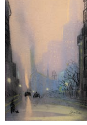
Leon Dolice (1892–1960) View of the Chrysler Building, New York, at Dusk Pastel on paper 11<sup>1</sup>/<sub>8</sub> x 7<sup>1</sup>/<sub>8</sub> inches Signed lower right: Dolice