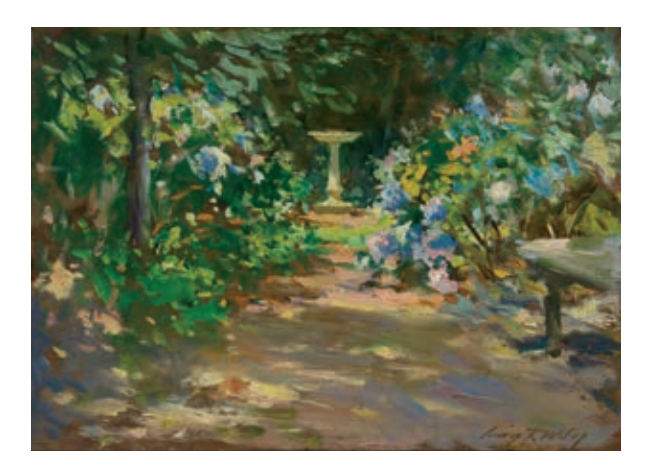
Irving Ramsay Wiles (1861–1948) Pathway in the Garden Oil on panel 9^3/4 \times 13^{15}/16 inches Signed lower right: Irving R Wiles