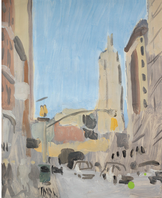
Fairfield Porter (1907–1975) Broadway South of Union Square, New York Oil on paper 16½ x 13¼ inches (sight size) $45,000