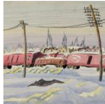
4 Charles Burchfield (1893–1967) (Untitled) The Freight Train Watercolor and pencil on paper 11⅞ x 18 inches