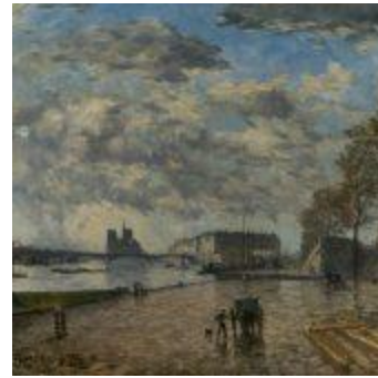
19 Frank Myers Boggs (1855–1926) Quai Henri IV à Paris Oil on canvas 28 15/16 x 36 1/4 inches Signed and inscribed lower left: Frank-Boggs Paris