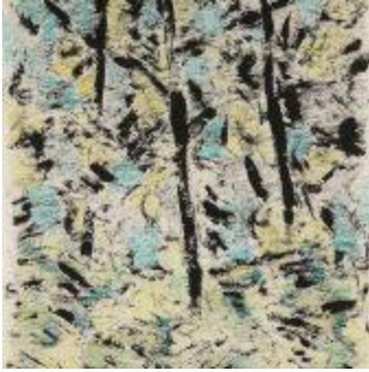
1 Milton Avery (1885–1965) Sunlit Forest , 1956 Pastel and gouache on paper 23½ x 17¾ inches (sight size) Signed and dated lower left: Milton Avery 1956 ; on verso: Sunlit Forest by Milton Avery 24 x 18 1956