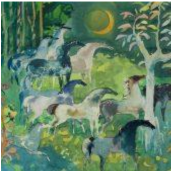
2 Millard Owen Sheets (1907–1989) The Night Herd Watercolor, gouache, and pencil on paper 21¾ x 29¼ inches (sight size) On verso: "THE NIGHT HERD" / Millard Sheets