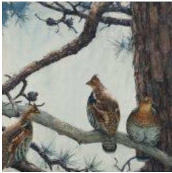
13 A. Lassell Ripley (1896–1969) Three Grouse on a Hard Pine Watercolor and gouache on paper 19 5/16 x 27 15/16 inches Signed lower right: A. Lassell Ripley ©