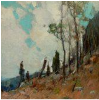
17 Chauncey Foster Ryder (1868–1949) On the Mountain Side Oil on canvas 24 3/16 x 20 3/16 inches Signed lower right: Chauncey F Ryder