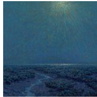
20 Granville Redmond (1871–1935) Moonlight on the Marsh Oil on canvas 12 x 16 inches Signed lower left: Granville Redmond