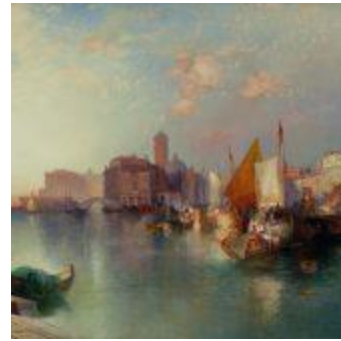
15 Thomas Moran (1837–1926) Venice , 1896 Oil on canvas 14 1/16 x 20 1/16 inches Monogrammed and dated lower right: TMORAN. 1896. ; on stretcher bar: Venice, Moran.