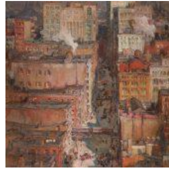
8 Colin Campbell Cooper (1856–1937) Downtown, New York, 1908 Pastel, gouache, and pencil on paper laid down on board 29 1/4 x 21 1/4 inches (sight size) Signed and dated lower right: Colin Campbell Cooper / 1908