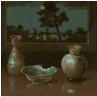
14 Harry Willson Watrous (1857–1940) Syro-Roman Glass Oil on canvas laid down on board 7 7/8 x 9 15/16 inches Signed lower right: Watrous