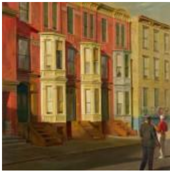
6 Adolf Ferdinand Konrad (1915–2003) Music on Fulton Street, 1954 Oil on canvas 22 x 18 1/4 inches Signed and dated lower left: Konrad 1954