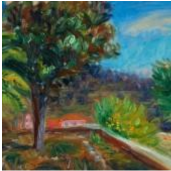
18 William Glackens (1870–1938) View into a Garden Oil on panel 8 7/16 x 10 11/16 inches On verso: W. G. / by E. G.