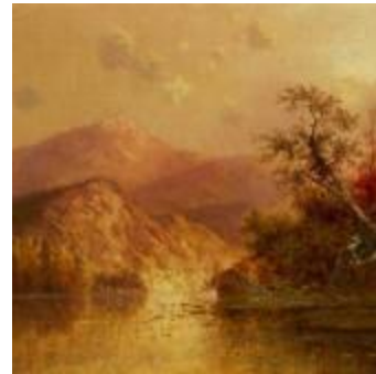
16 Charles H. Chapin (1830–1889) Autumn Landscape , 1877 Oil on canvas 11 1/2 x 16 7/8 inches Signed and dated lower right: C.H. Chapin / 77