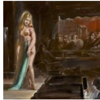
7 Reginald Marsh (1898–1954) Burlesque Queen Oil on masonite 16 1/16 x 20 inches Signed lower right: MARSH