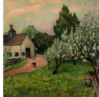
3 Hayley Lever (1876–1958) Spring In Caldwell, New Jersey , 1928 Oil on canvas 24 1/16 x 30 1/16 inches Signed and indistinctly dated lower right: Hayley Lever 19[illegible] ; on stretcher bar: SPRING IN CALDWELL, N.J. 1928