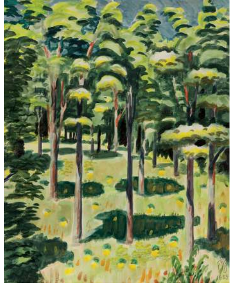
Charles Burchfield (1893–1967) Woodland Scene , 1939 Watercolor on paper 22 x 18 inches Monogrammed and dated lower right: CEB / 1939 ; on verso: Woodland Scene

Although Turner did not achieve critical success until she was in her fifties, in 1921, she became the fourth woman ever to be accepted as an academician by the National Academy of Design. In 1914, the Metropolitan Museum of Art purchased one of her portraits, and she was distinguished with a solo exhibition at the High Museum of Art in the late 1920s. More recently, Turner was honored with a retrospective at the Dixon Gallery and Gardens in 2010.