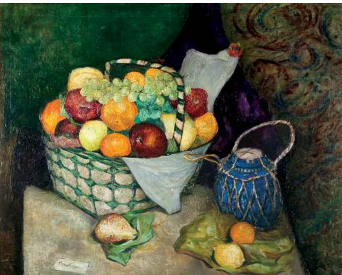
Hayley Lever (1876–1958) Basket of Fruit Oil on canvas 29 1 / 2 x 35 3 / 4 inches Signed lower right: Hayley Lever \