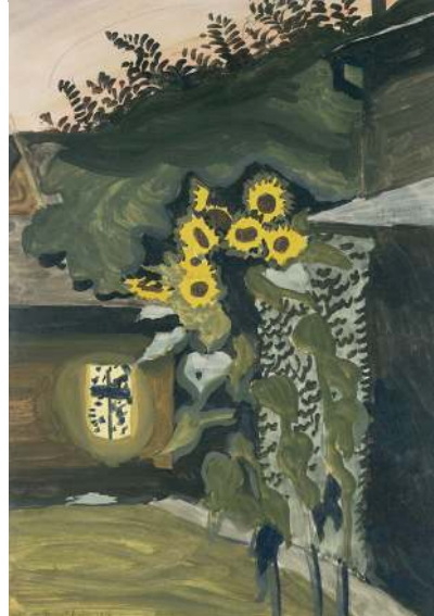
Charles Burchfield (1893–1967) Sunflowers at Late Dusk , 1916 Gouache, watercolor, and pencil on paper 19 1 / 8 x 13 7 / 16 inches Signed and dated lower left: Chas Burchfield – 1916; on verso: Sunflowers at Late Dusk / August 24, 1916 –