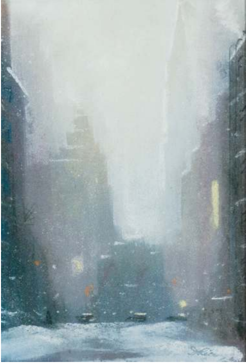
Leon Dolice (1892–1960) New York City in the Snow Pastel on paper 11½ x 7¾ inches (sight size) Signed lower right: Dolice