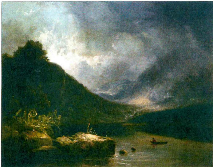
Thomas Doughty, Sublime Landscape , n.d., oil on canvas mounted to board, 14 1/4" x 17 1/4". Questroyal Fine Art.