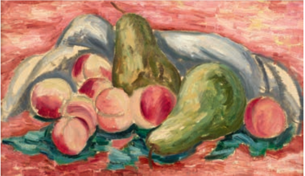
Marsden Hartley (1877–1943) Still Life with Peaches and Pears