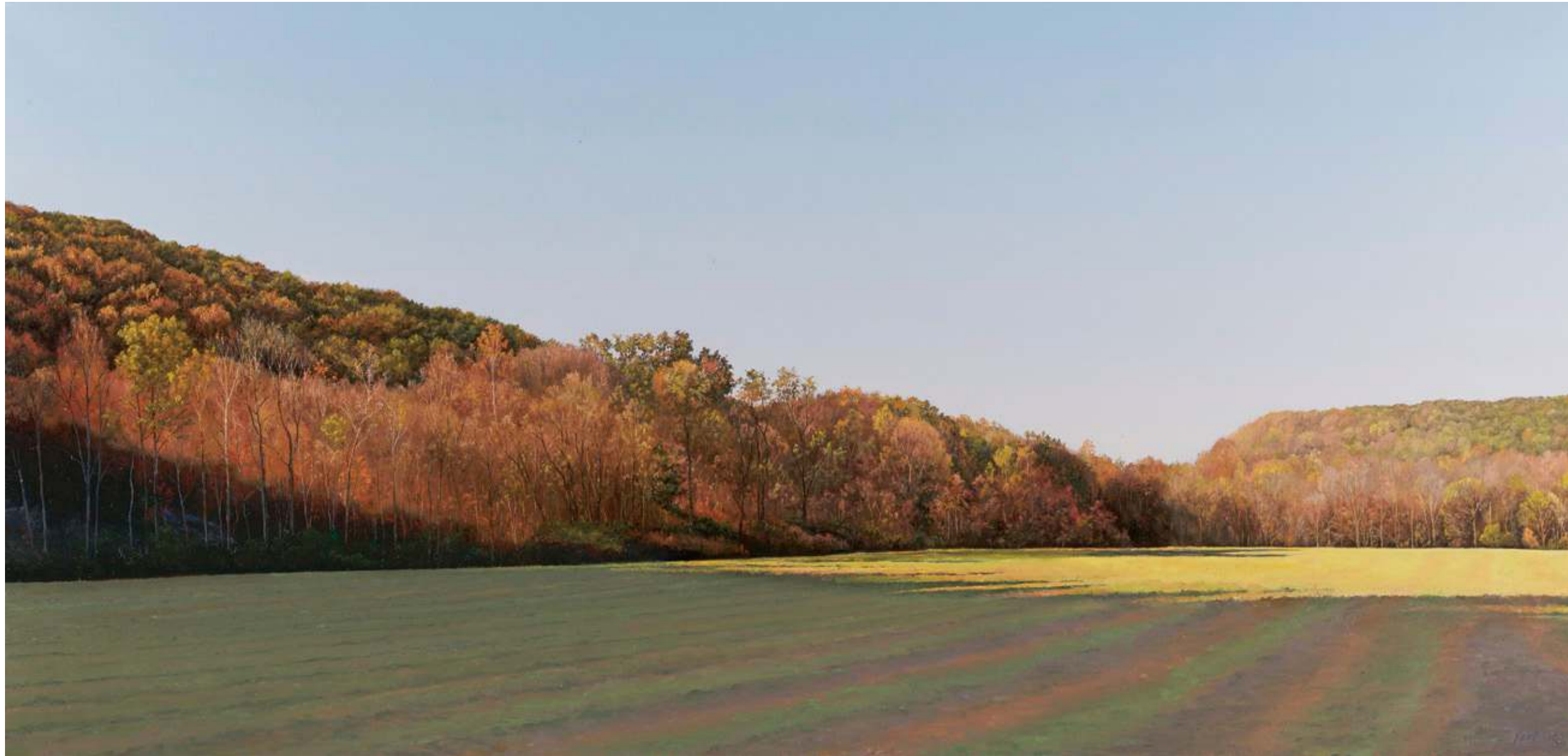
Mine Hill Preserve, 2016 Oil on linen 15 x 30 inches Signed and dated lower right: Yost '16