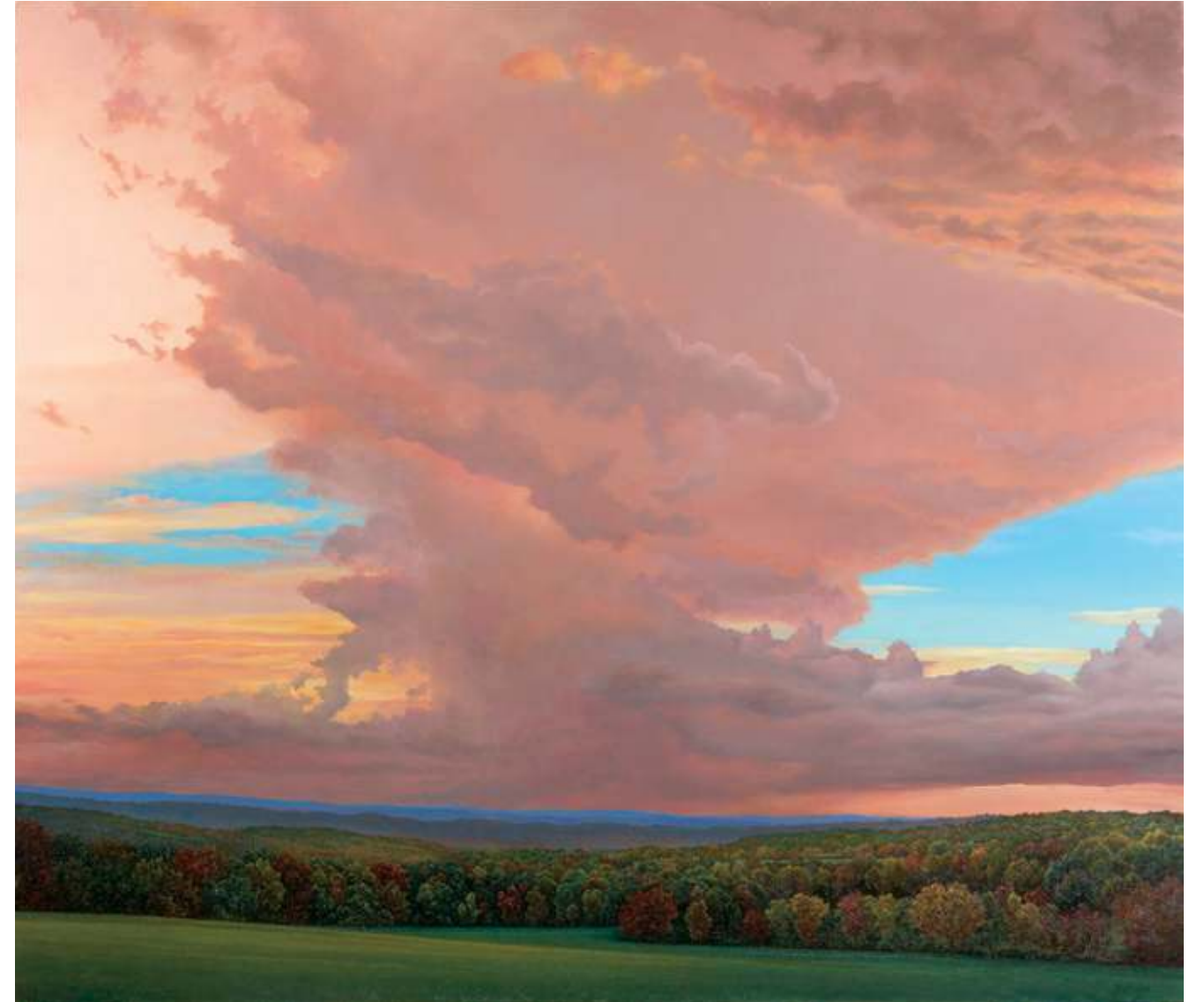
Storm Approaching Painter Ridge, 2016 Oil on linen 30 x 35 inches Signed and dated lower right: Yost 2016