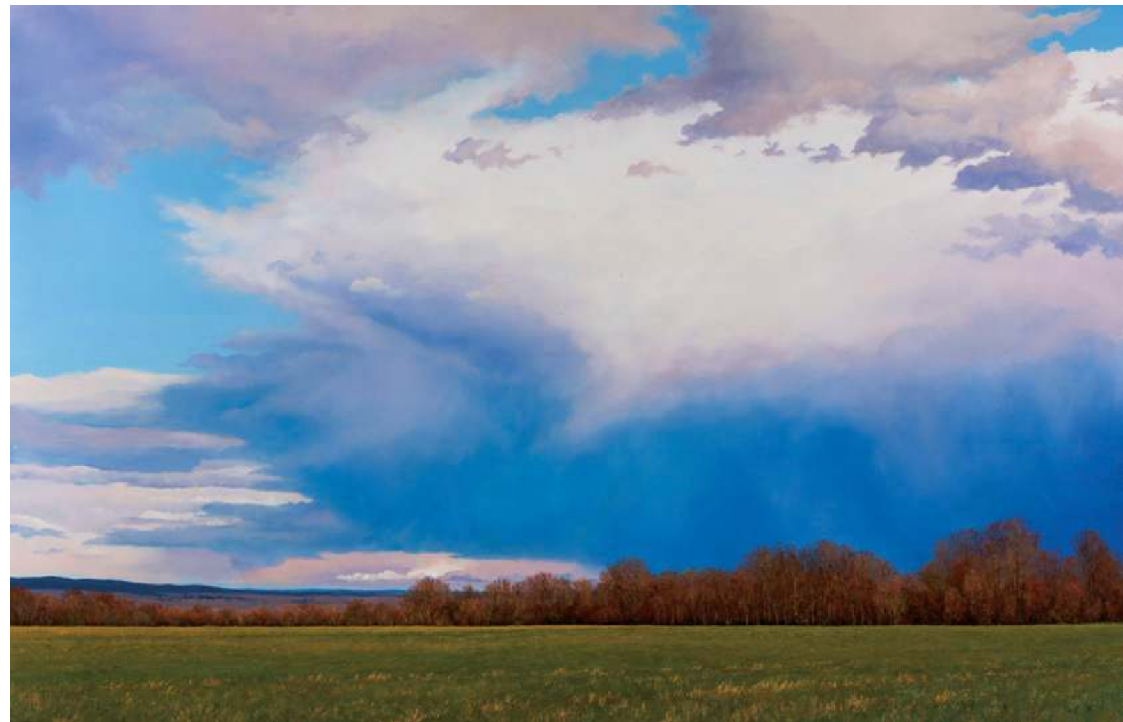
Storm Cloud , 2016 Oil on linen 20 1 / 4 x 30 inches Signed and dated lower right: Yost '16