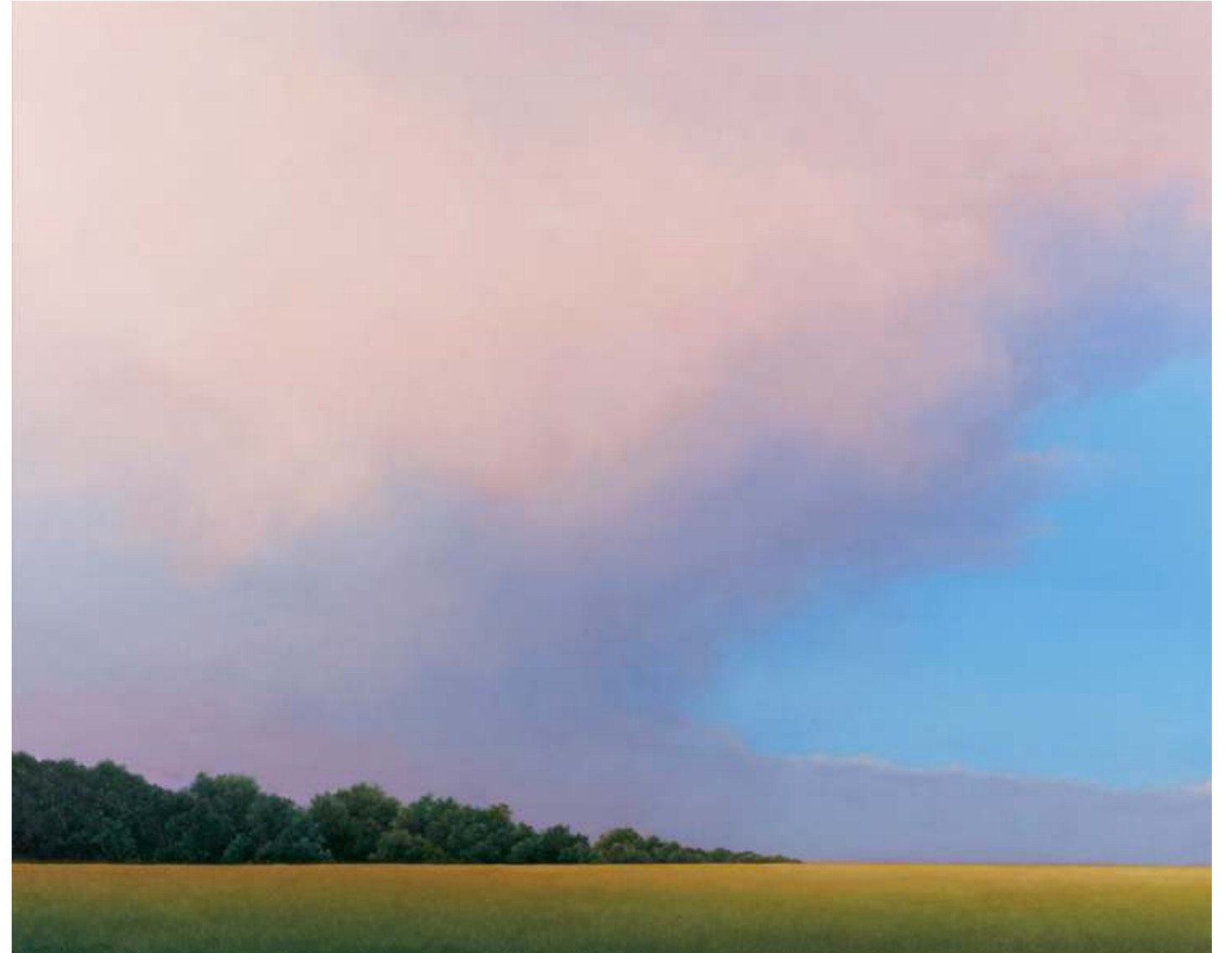
Passing Clouds, 2016