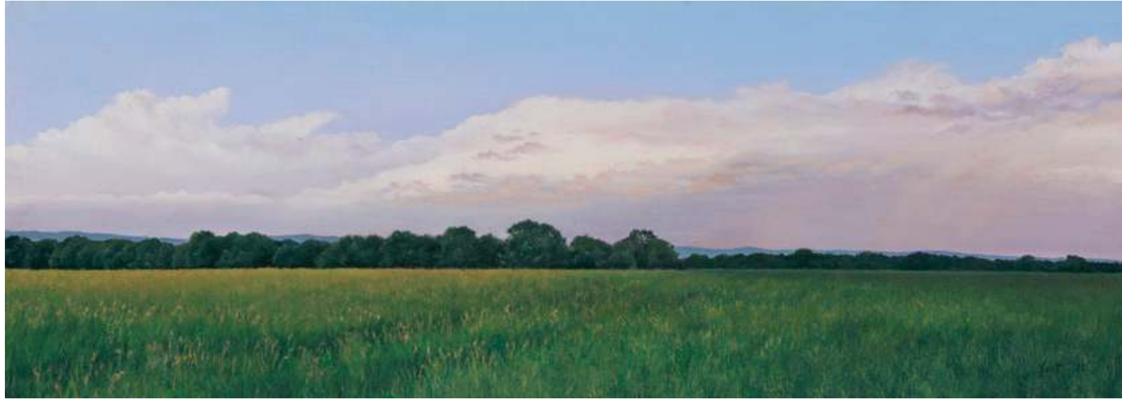
Summer Grasses, 2012 Oil on linen 6 x 16 inches Signed and dated lower right: Yost '12