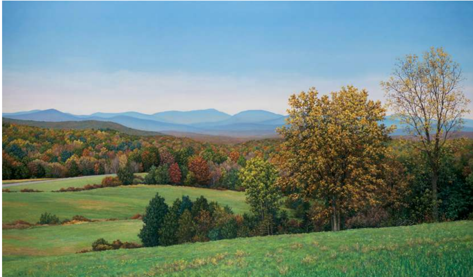
Shawangunk Valley, 2016 Oil on linen 24 x 40 3 / 8 inches Signed and dated lower left: Yost '16