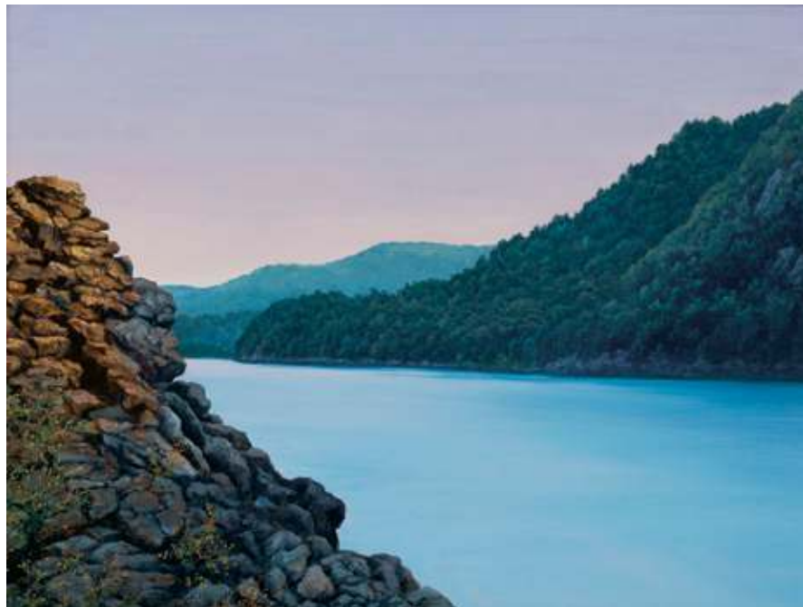
View from Breakneck Ridge, 2016 Oil on panel 9 x 12 inches Signed and dated lower left: Yost '16