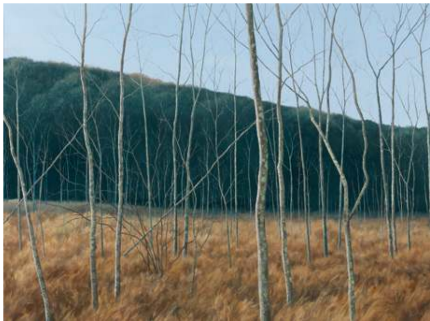
Marsh on the Lilly Preserve, 2010 Oil on linen 18 1 / 8 x 24 1 / 8 inches Signed and dated lower right: Yost '10