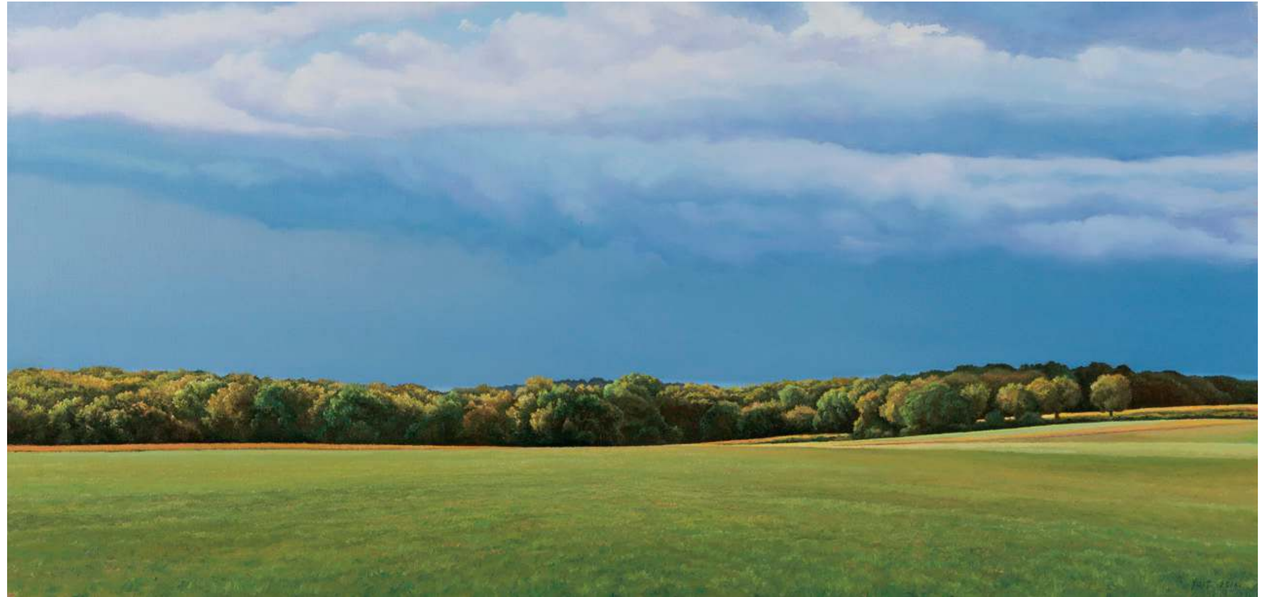
Good Hill Farm Preserve, 2016