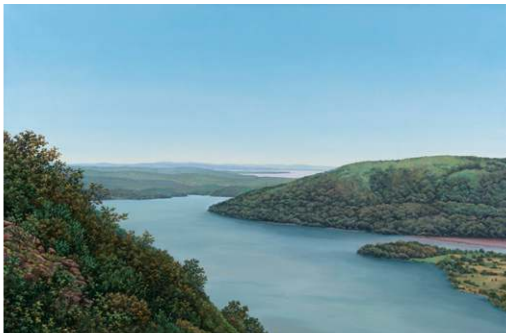
Stony Point, 2016 Oil on linen 16 1 / 8 x 24 1 / 16 inches Signed and dated lower left: Yost '16