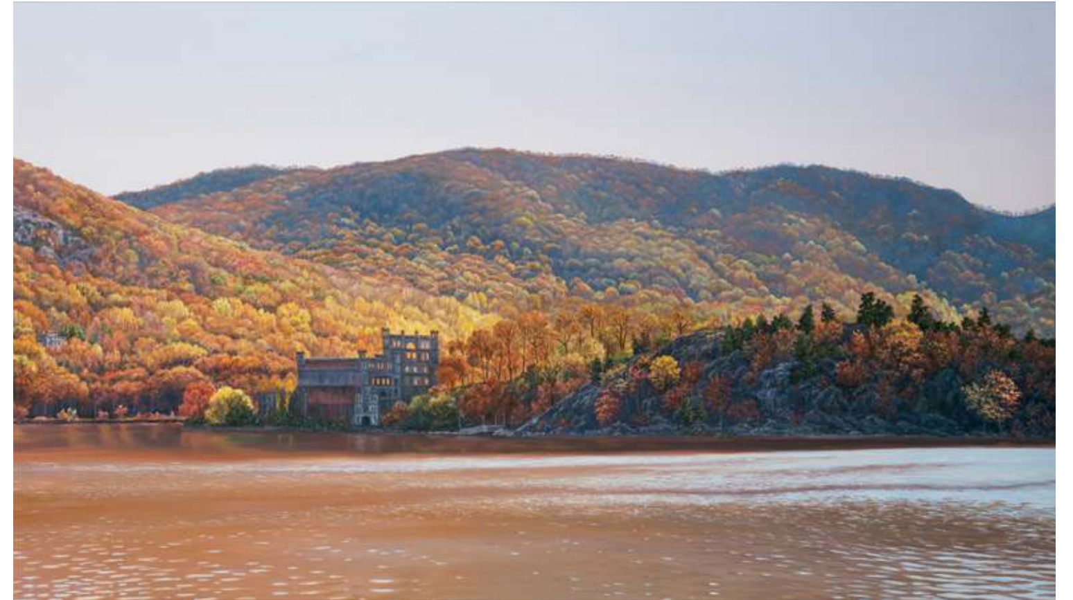
Bannerman Castle, 2017 Oil on linen 14 x 24 1 / 8 inches Signed and dated lower left: Yost '17