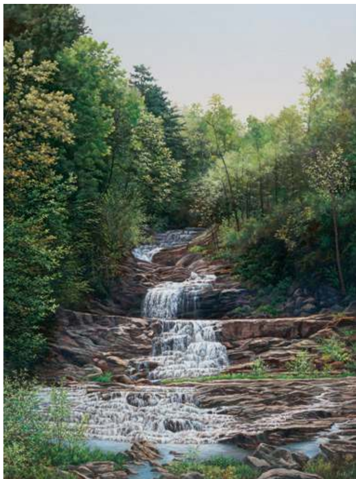
Kent Falls, 2017 Oil on linen 21 1 / 8 x 16 inches Signed and dated lower right: Yost '17