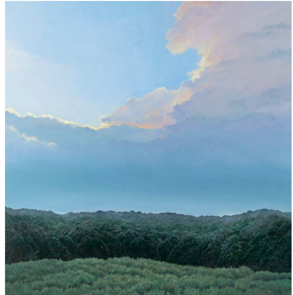
Storm Clouds, Matthau Preserve, 2007 Oil on linen 30 1 / 4 x 30 inches Signed and dated lower right: Yost 07