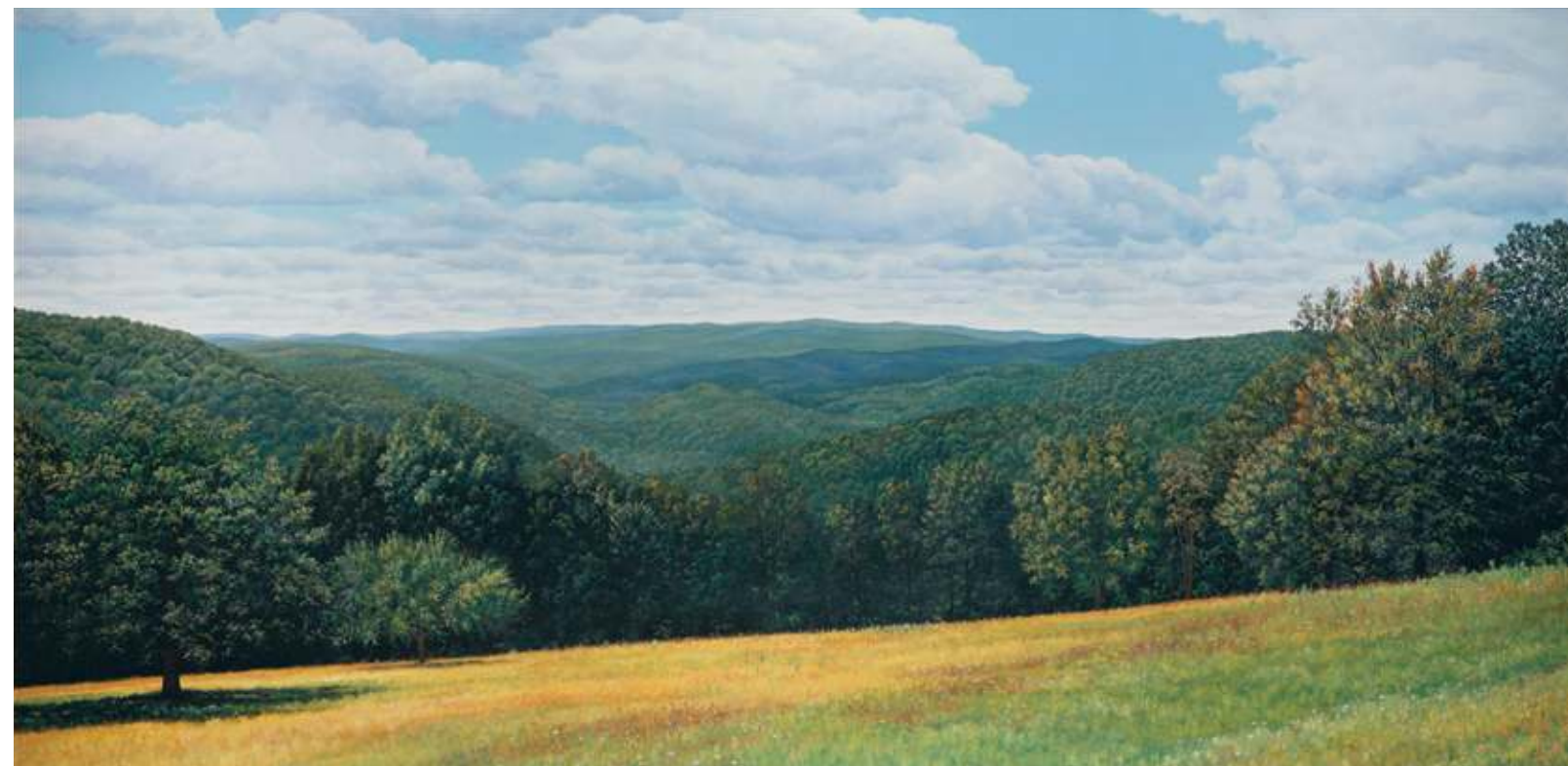
Housatonic Valley, 2011 Oil on linen 24 1 / 2 x 48 1 / 4 inches Signed and dated lower right: Yost '11