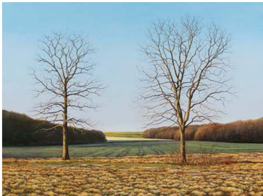
Two Hickories, 2016 Oil on linen 15 x 20 1 / 16 inches Signed and dated lower right: Yost '16