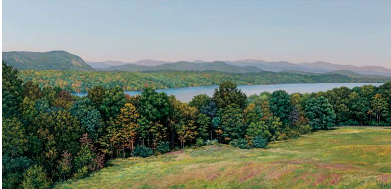
The Hudson from Vanderbilt Mansion, 2017