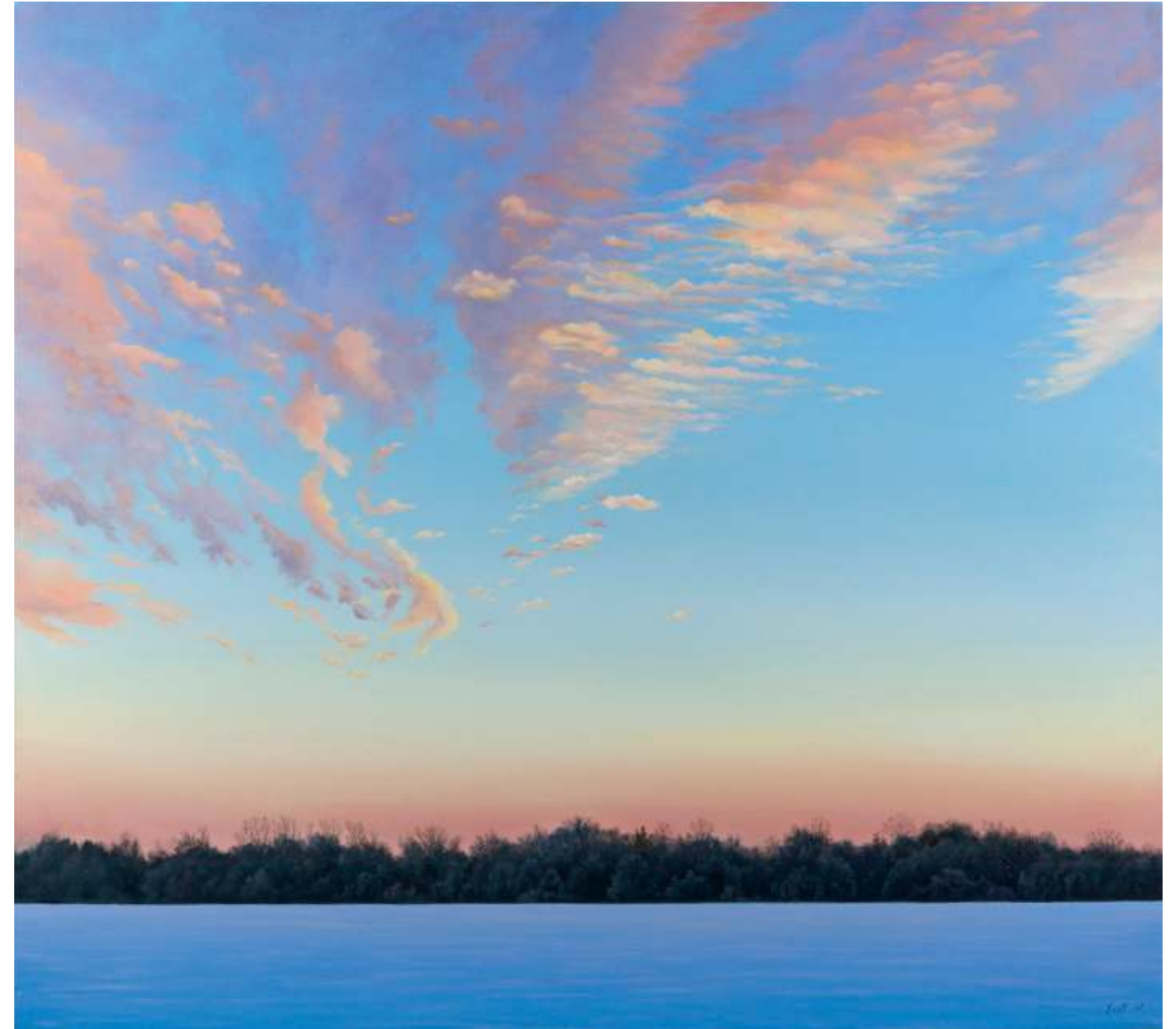
Winter Sunset at Good Hill Farm, 2017 Oil on linen 22 x 24¼ inches Signed and dated lower right: Yost '17