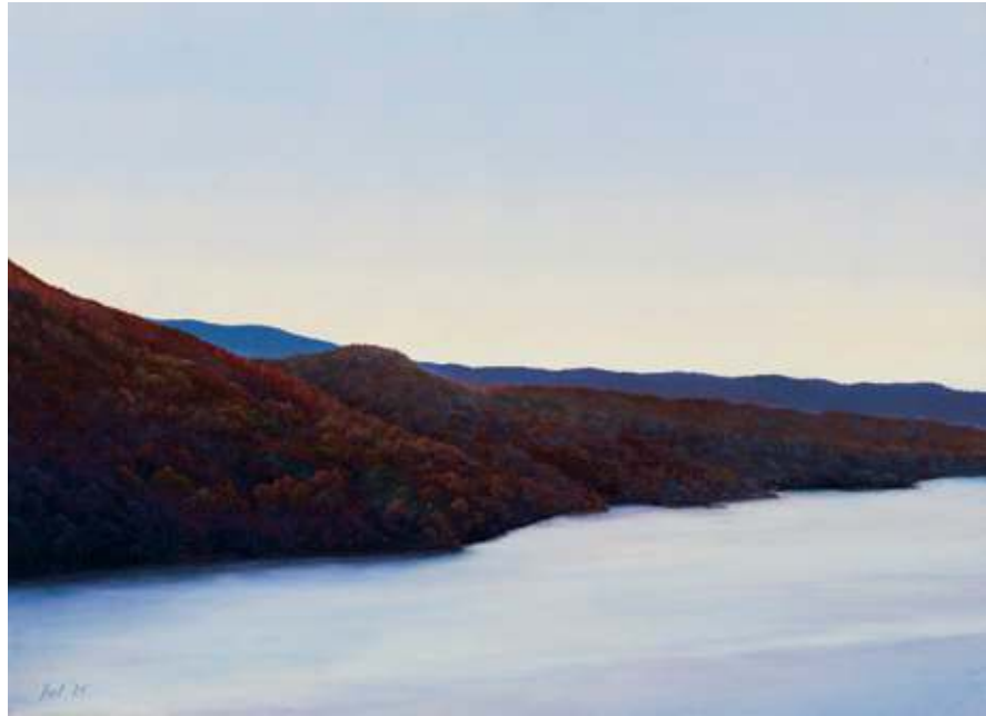
Dusk, 2015 Oil on linen 10 x 13½ inches Signed and dated lower left: Yost '15