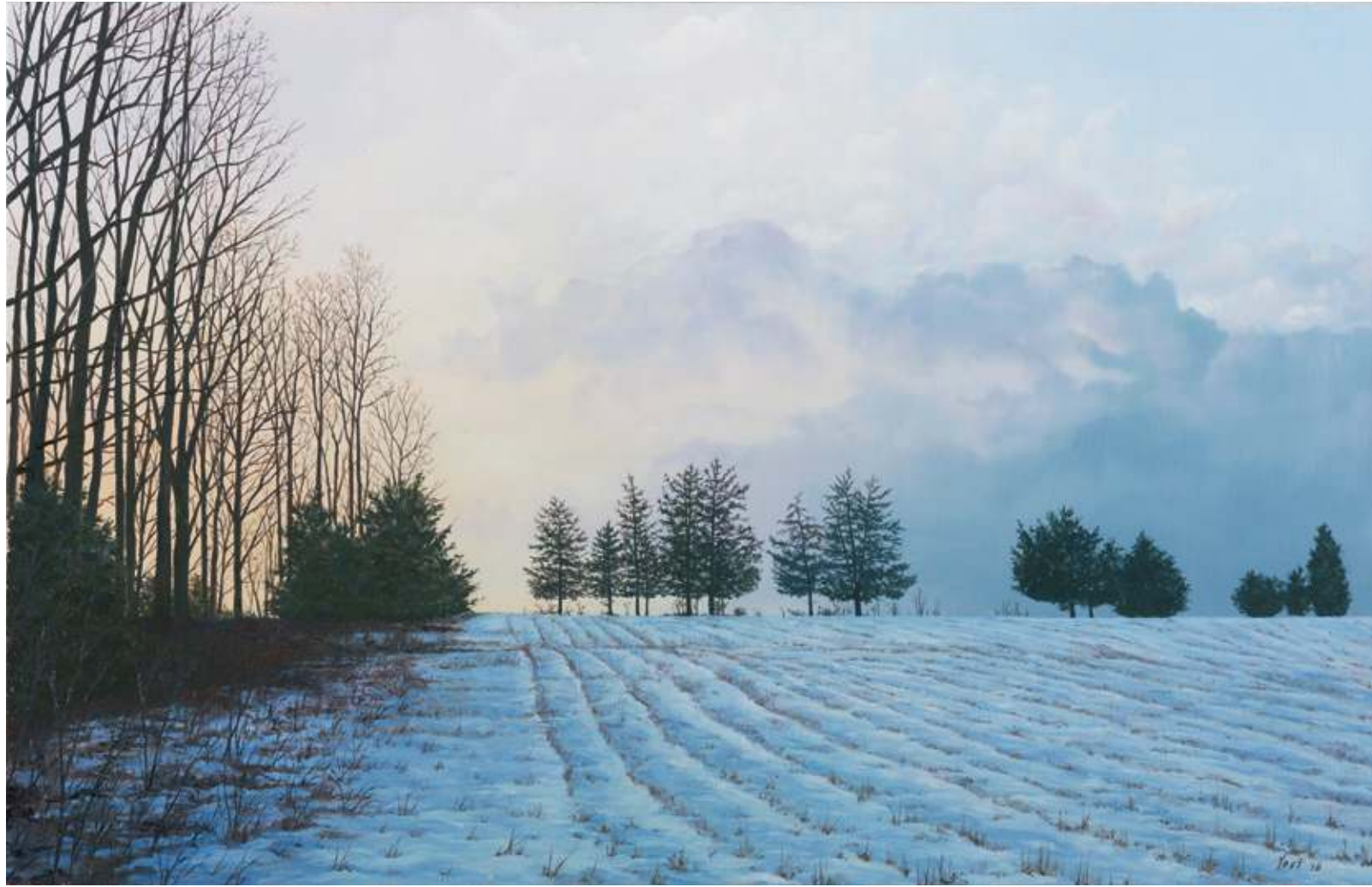
Spring Farm in Winter, 2018 Oil on linen 12 x 18 inches Signed and dated lower right: Yost '18