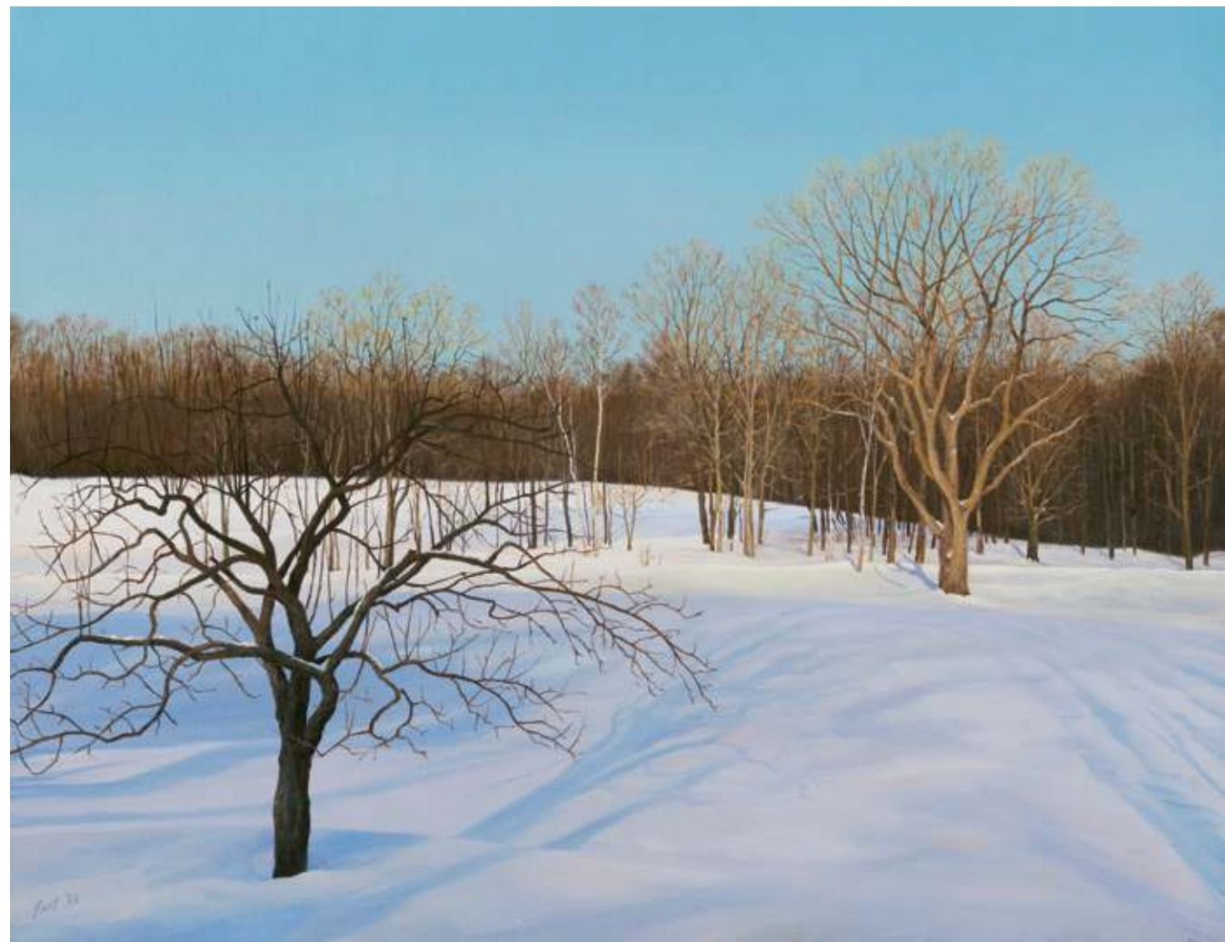
Winter Trees , 2013 Oil on linen 12 x 15 1 / 16 inches Signed and dated lower left: Yost '13