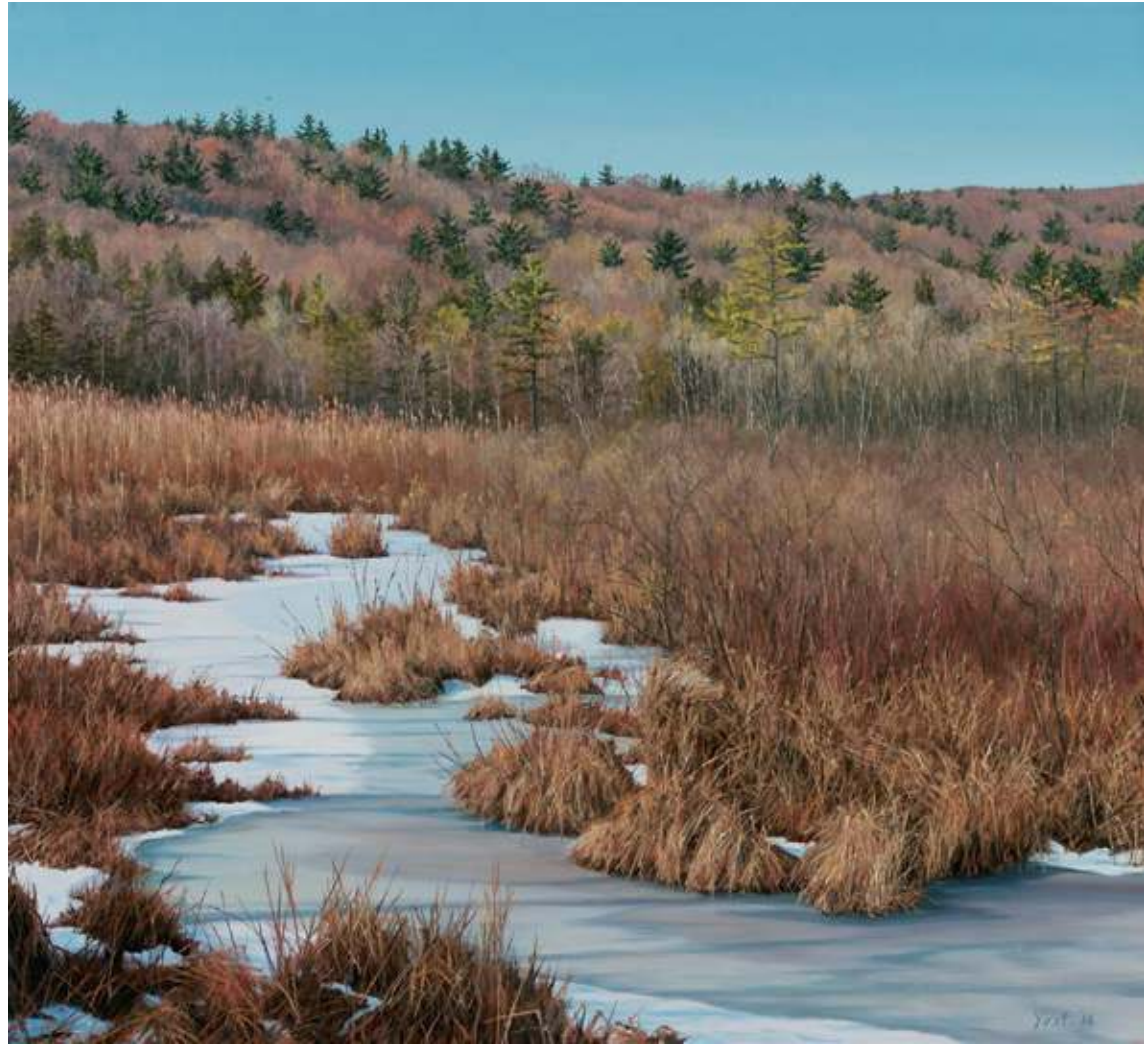
Frozen Marsh, 2016