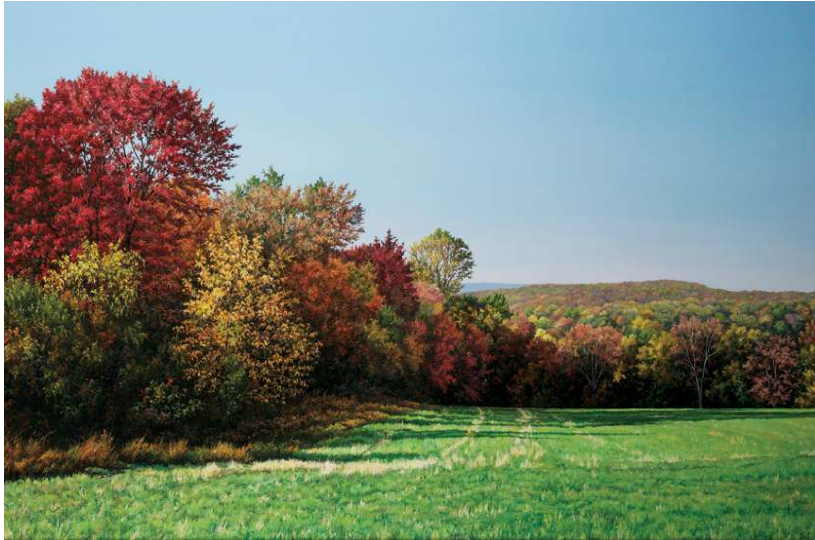
Northern Pasture, Toplands Farm, 2017 Oil on linen 20 1 / 16 x 30 1 / 16 inches Signed and dated lower right: Yost '17