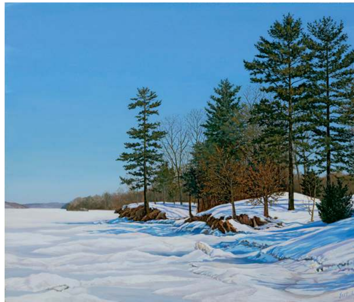
View of Bard Rock, 2015 Oil on linen 12 x 14 inches Signed and dated lower right: Yost 15