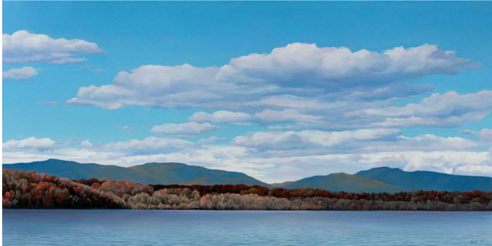
Catskills from the Hudson, 2017 Oil on linen 18 x 36 1 / 8 inches Signed and dated lower right: Yost '17