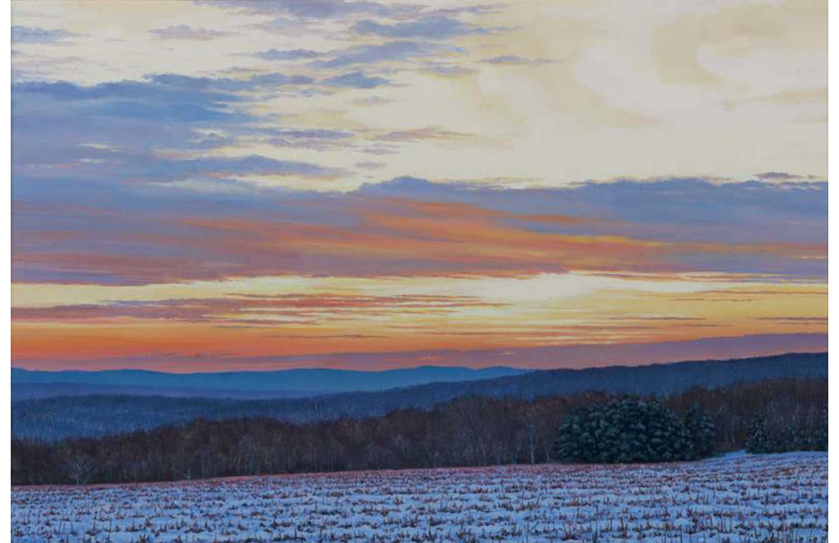
DESIGN: Malcolm Grear Designers PRINTING: Meridian Printing