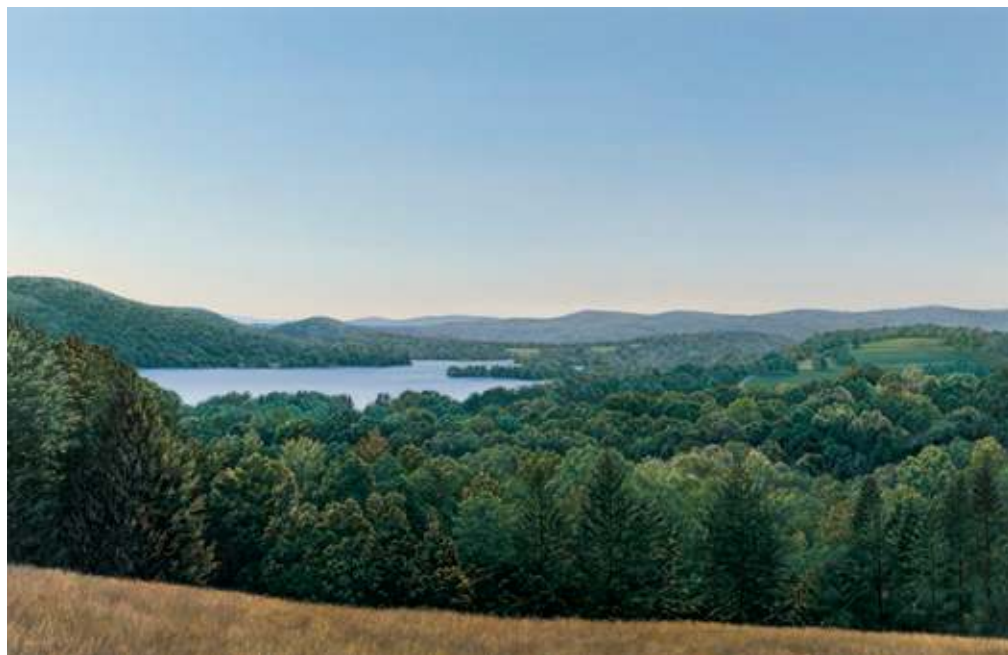
Lake Waramaug from Tanner Hill, 2011 Oil on linen 20 1 / 8 x 30 3 / 8 inches Signed and dated lower right: Yost '11