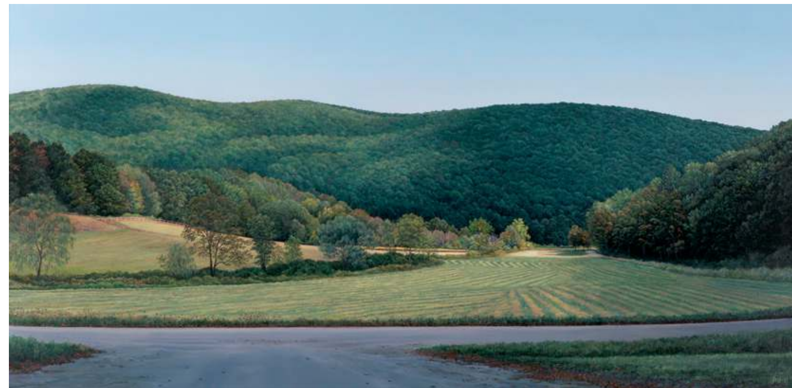
Afternoon in Kent, 2011 Oil on linen 20 1 / 8 x 40 inches Signed and dated lower right: Yost '11