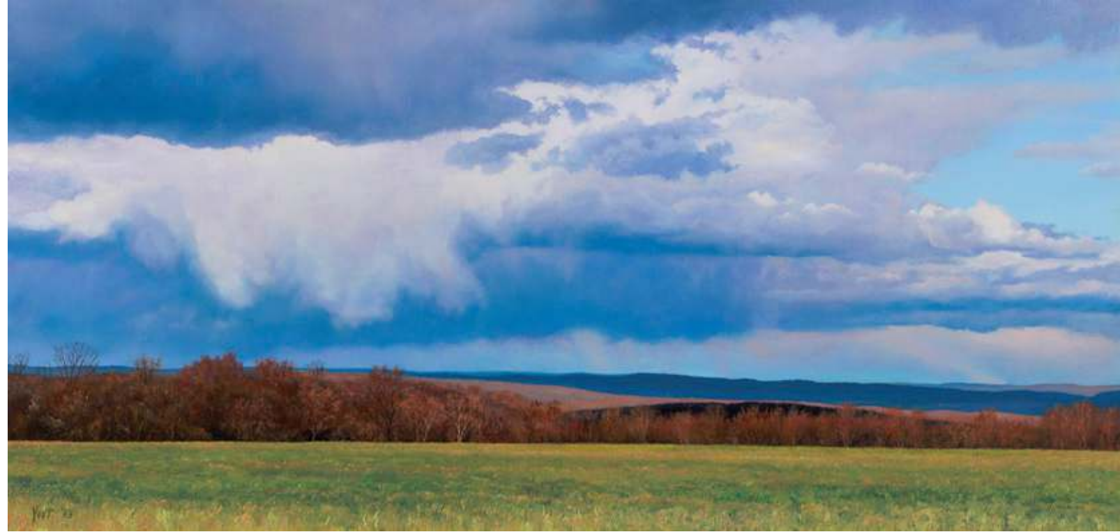
November Afternoon, 2013