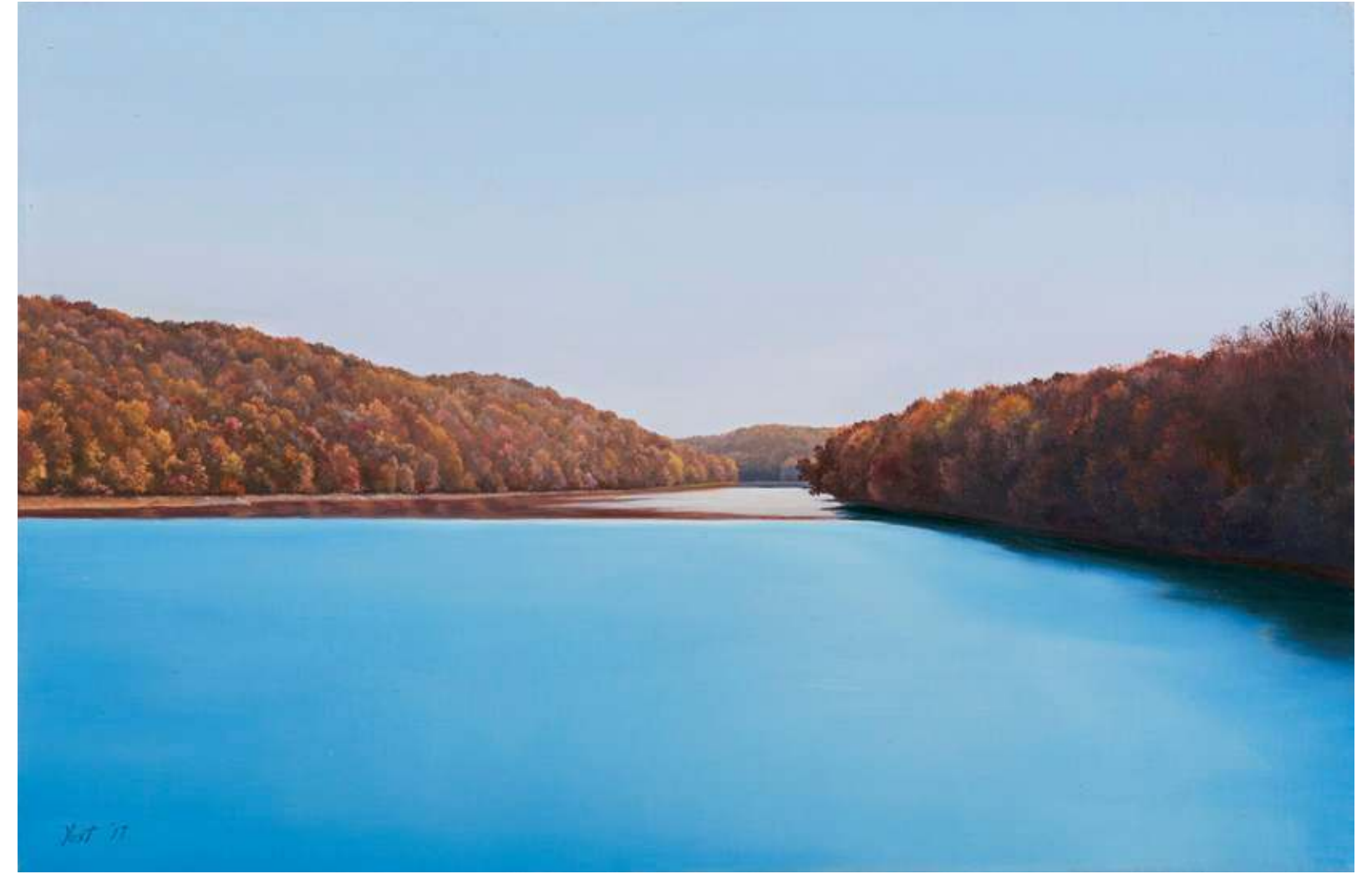
Lake Lillinah, 2017