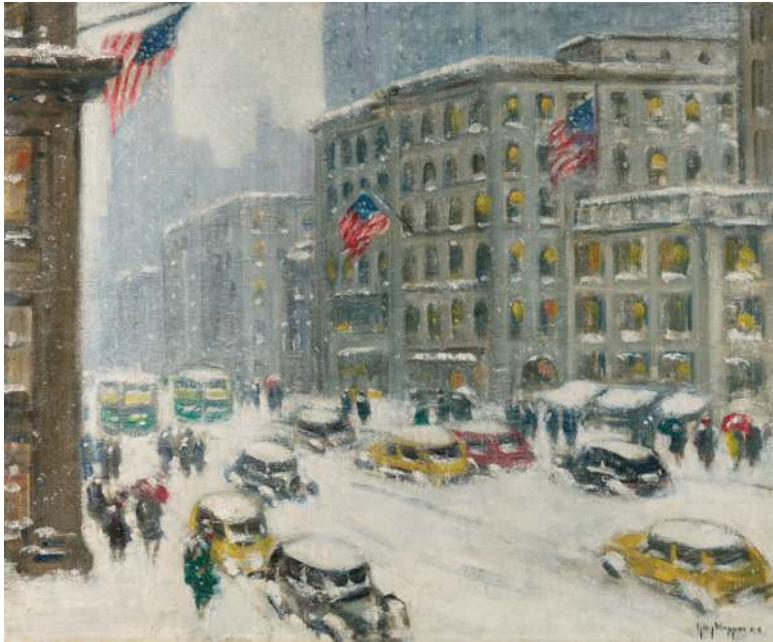
Guy C. Wiggins (1883–1962) Midtown, Fifth Avenue, Winter Oil on canvas 25 3 / 16 x 30 1 / 8 inches Signed lower right: Guy Wiggins NA

Winter scenes of New York City were a self-proclaimed favorite of Guy C. Wiggins, whose iconic depictions of New York landmarks are second only to those of Childe Hassam in both appeal and value.