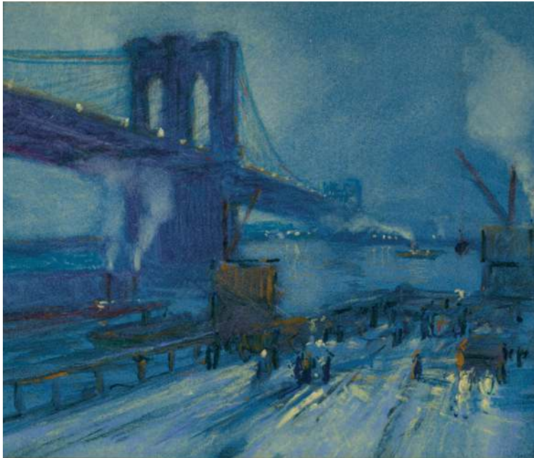
Jonas Lie (1880–1940) View of Brooklyn Bridge Pastel on paper 9 3 / 4 x 11 7 / 8 inches (sight size) Signed lower left: Jonas Lie

Jonas Lie was president of the National Academy of Design from 1934 to 1939. This painting, of one of the most iconic American structures, has been exhibited in six museums.