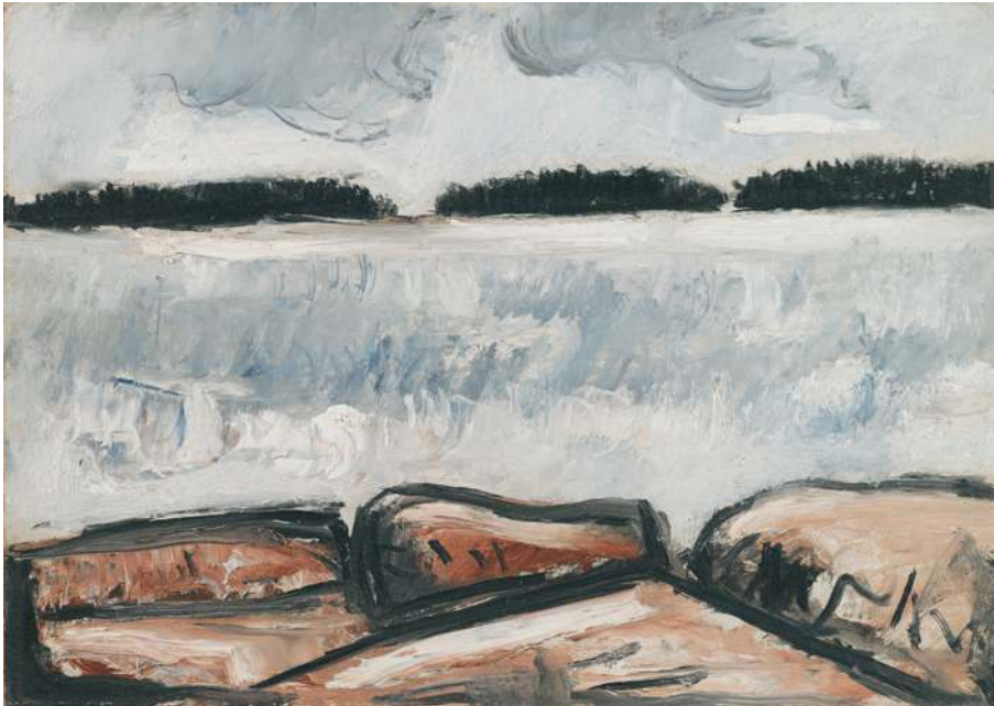
Marsden Hartley (1877–1943) Islands, Penobscot Bay Oil on board laid down on board 9 7 / 8 x 13 7 / 8 inches

Marsden Hartley's paintings of Maine are the focus of the current major exhibition at the Met Breuer. One of the first to be held at the recently opened museum, it has drawn significant praise and attention from critics.