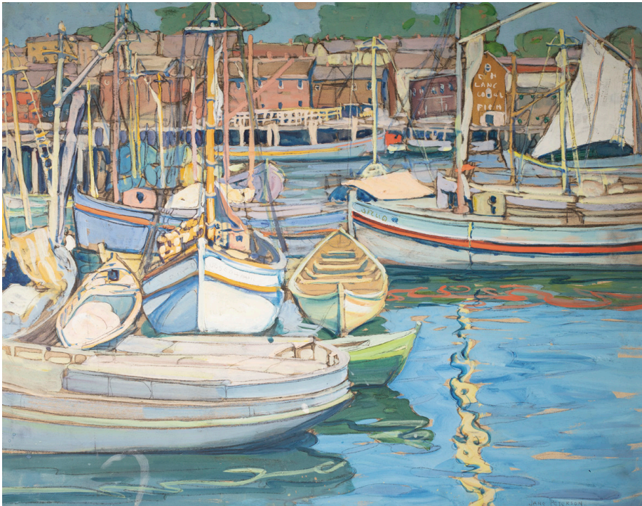
Jane Peterson (1876–1965)