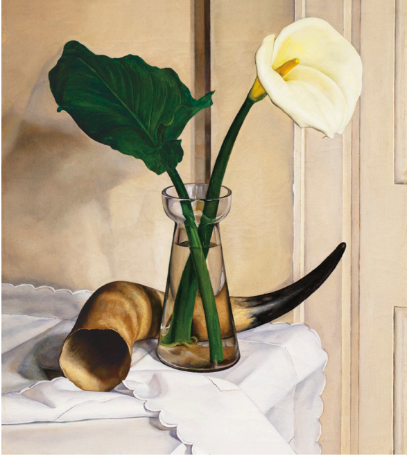
Luigi Lucioni (1900–1988) Still Life by the Windowsill , 1933

Oil on canvas 18 1 / 8 x 16 1 / 16 inches