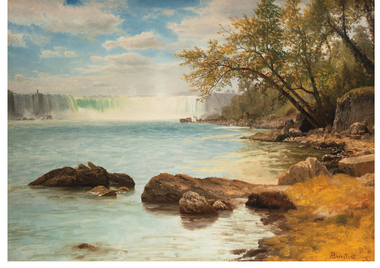
Albert Bierstadt Niagara Falls with Terrapin Tower Oil on paper laid down on canvas 20<sup>1</sup>/8 x 28 inches Monogrammed lower right: ABierstadt