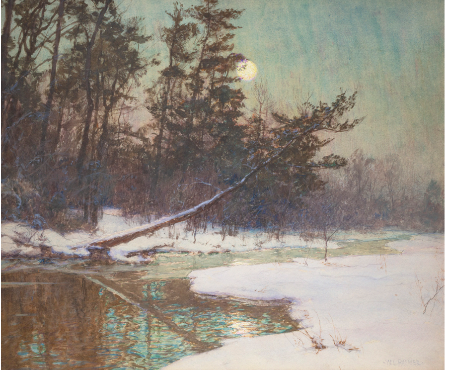
Walter Launt Palmer (1854–1932) Moonrise Over a Snowy Landscape Watercolor, gouache, and crayon on paper laid down on board 19 15 / 16 x 23 7 / 8 inches Signed lower right: –W.L. PALMER–