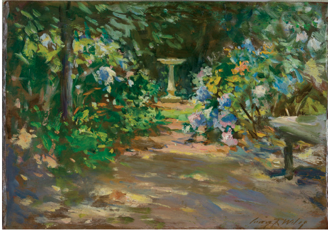
Irving Ramsay Wiles (1861–1948) Pathway in the Garden Oil on panel 9 3 / 4 x 13 15 / 16 inches Signed lower right: Irving R Wiles Asking price: $68,500