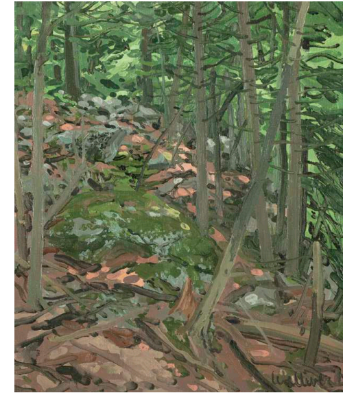
Neil Welliver (1929–2005) Landscape Study, 1979 Oil on linen 14 x 11 3 / 4 inches Signed lower right: Welliver , on verso: © Welliver / 1979 Asking price: $19,500