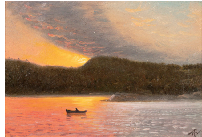
Nelson Augustus Moore (1824–1902) Sunlit Seascape, 1889 Oil on canvas laid down on plexiglass 6 1 / 2 x 9 7 / 8 inches Monogrammed lower right: NAMoore ; on verso: Study from Nature / N.A. Moore / 1889 ; estate stamp on verso Asking price: $13,500