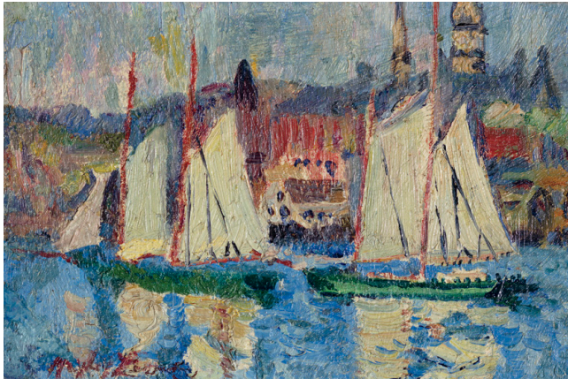
Hayley Lever (1876–1958) Fishing Boats Returning to Gloucester, Massachusetts, 1914 Oil on canvas 5 3 / 4 x 8 5 / 8 inches Signed lower left: Hayley Lever ; on stretcher bar: Fishing Boats Returning Gloucester Mass 1914 Asking price: $17,500