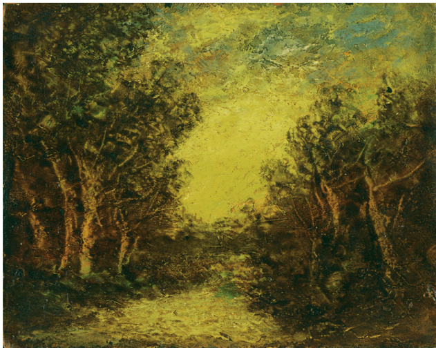
Ralph Albert Blakelock (1847–1919) Dancing Trees Oil on panel 7 7 / 8 x 9 7 / 8 inches Asking price: $37,500