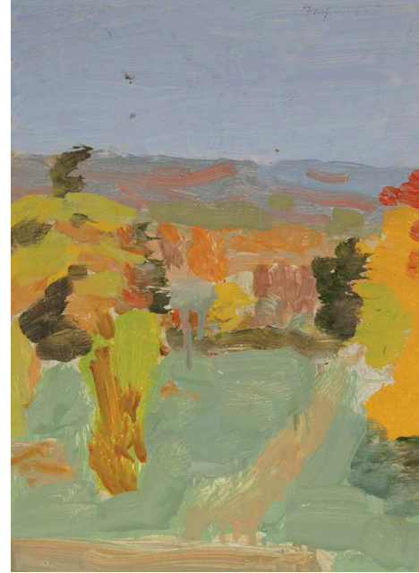
Fairfield Porter (1907–1975) Untitled [View of Pelham Hills from Artist's Studio in Fayerweather Hall, Amherst College], 1969 Oil on board 12 x 8 7 / 8 inches Signed and dated upper right: Fairfield Porter 69 Asking price: $29,500