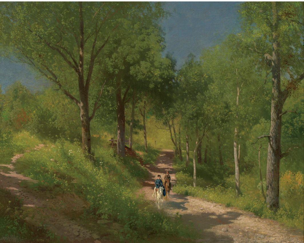
Hermann Herzog (1831–1932) Equestriennes in Fairmount Park Oil on canvas 19 3 / 4 x 24 5 / 8 inches Signed indistinctly lower left