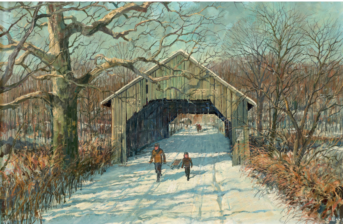
Eric Sloane (1905–1985) Covered Bridge in Winter Oil on board 21 \frac{1}{2} x 31 \frac{7}{8} inches (sight size) Signed lower right: SLOANE