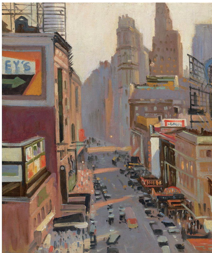
George Oberteuffer (1878–1940) Times Square Oil on board 14 x 11 \frac{7}{8} inches $13,500