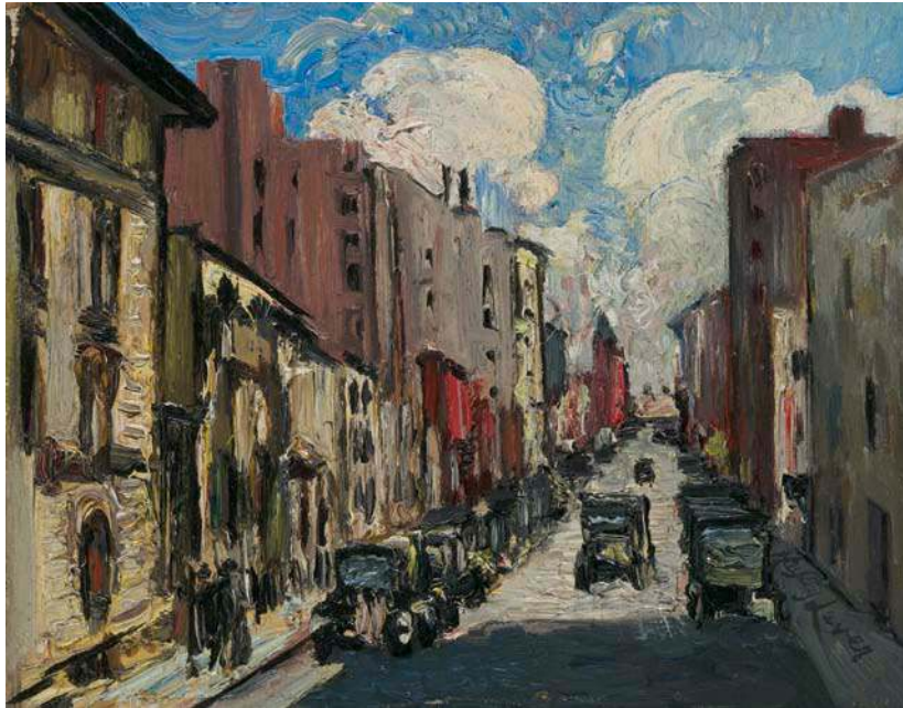
Hayley Lever (1876–1958) Downtown Street Scene Oil on board 7 7 / 16 x 9 7 / 16 inches Signed lower right: Hayley Lever