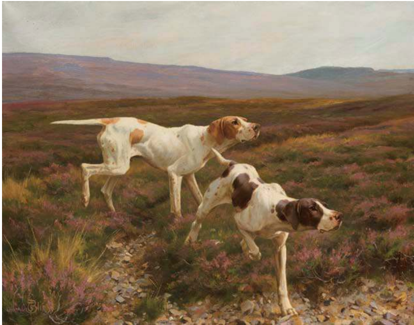
Thomas Blinks (1860–1912) English Pointers in a Landscape Oil on canvas 14 1 / 8 x 18 inches Monogrammed lower left: TBlinks