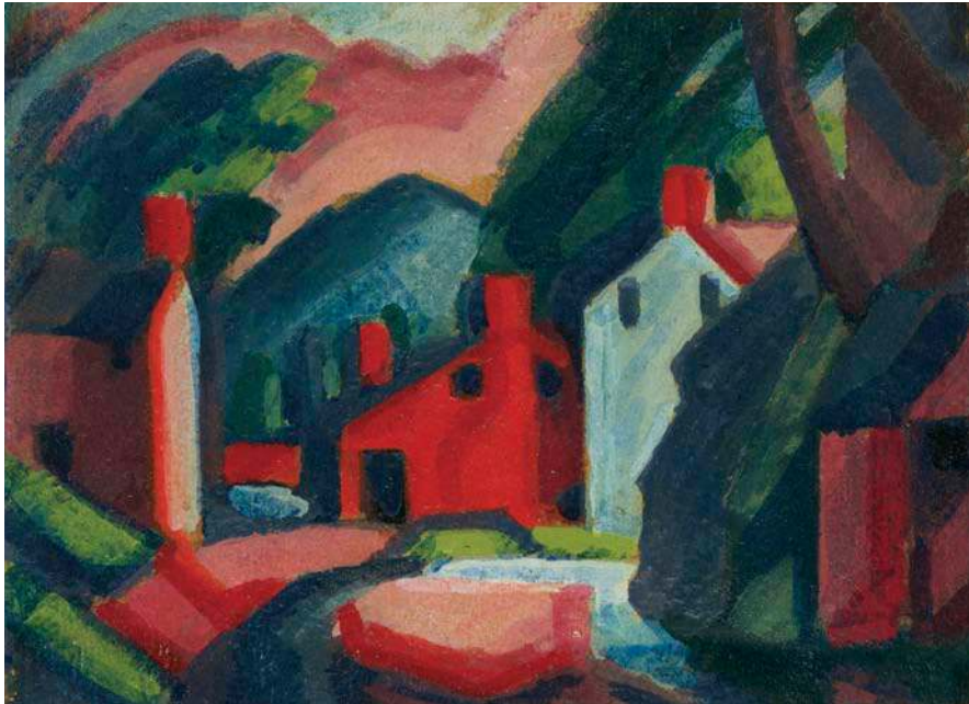
Oscar Bluemner (1867–1938) View of Lehmenburg, Pennsylvania, 1914 Gouache on paper 5 x 7 inches (approx.) Signed and dated center left margin: O. Bluemner N.Y. - 14