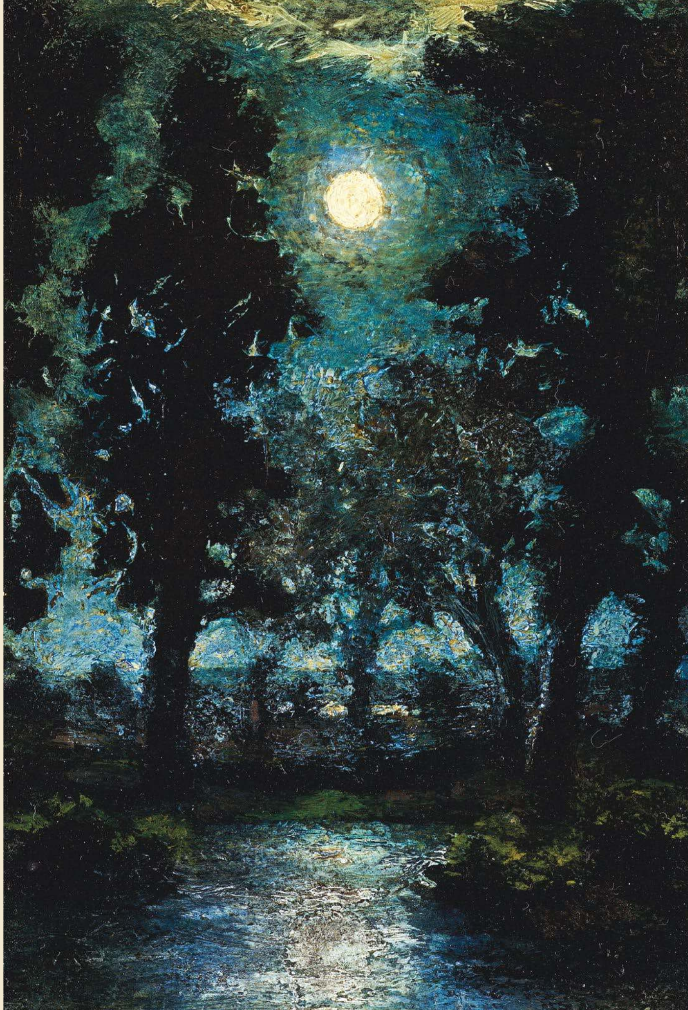
Ralph Albert Blakelock (1847-1919), Eternal Orb . Oil on board, 5 5 / 16 x 3 9 / 16 in.