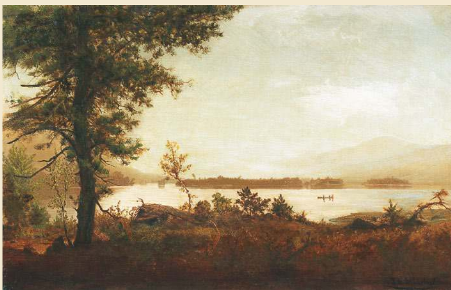
Ralph Albert Blakelock (1847-1919), Autumn Landscape . Oil on canvas, 11 \frac{1}{8} x 17 \frac{3}{16} in., signed lower right: 'R.A. Blakelock'.

Paired with Ryder, Albert Pinkham Ryder (another artist in need of reappraisal), in their interest in darkness and light and color without line, Blakelock ventured even further,