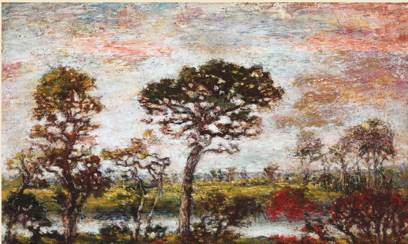
Ralph Albert Blakelock (1847-1919), Dream Within a Dream . Oil on panel, 5 \frac{1}{8} x 8 \frac{7}{8} in.

family became first a concern, then a mania. We know that he would leave his home in New Jersey with new paintings and not return home until he had sold them; even if he only earned a fraction of what he felt they were worth.