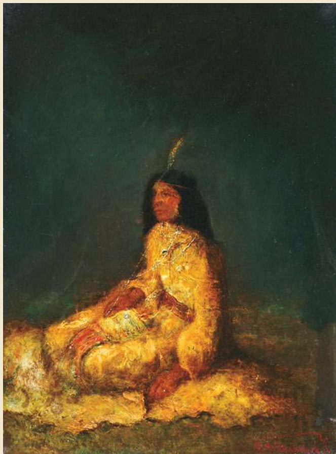
Ralph Albert Blakelock (1847-1919), Indian Madonna. Oil on panel, 8 1 / 8 x 6 1 / 8 in., signed in arrowhead lower right: 'R.A. Blakelock'.