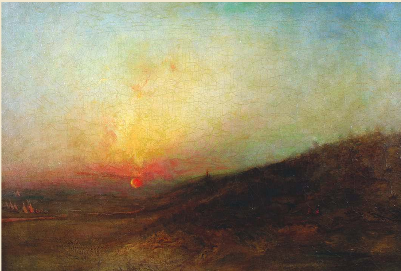
Ralph Albert Blakelock (1847-1919), Indian Encampment at Sunset . Oil on canvas, 20 x 30 in.