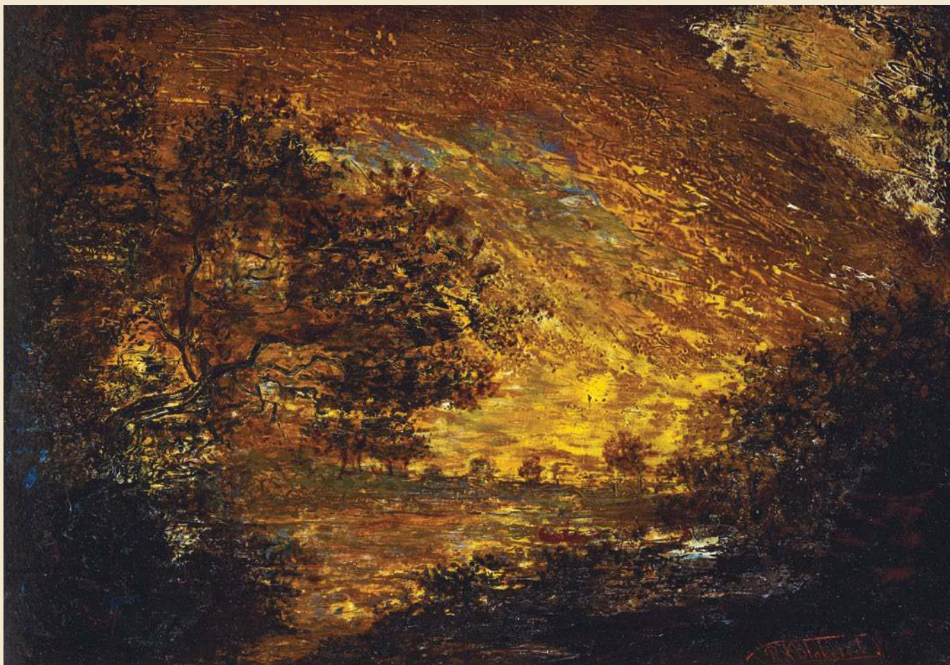
Ralph Albert Blakelock (1847-1919), The Last Red Canoe . Oil on panel, 14 \frac{7}{8} x 21 \frac{3}{4} in., signed lower right in arrowhead: 'R.A Blakelock'.

Ralph Albert Blakelock: The Mad Genius Returns at Questroyal Fine Art