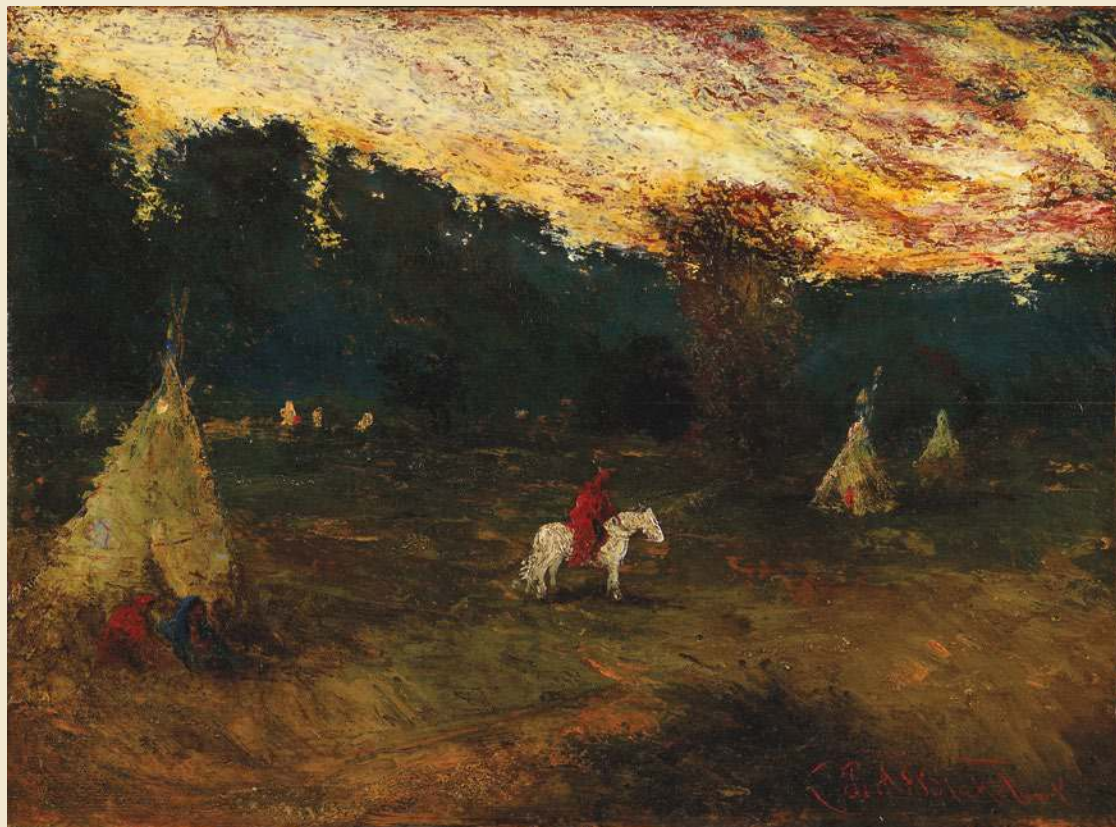
Left: Ralph Albert Blakelock (1847-1919), Indian Hunters . Oil on panel, 11½ x 15⅞ in., signed lower right in arrowhead: 'R.A. Blakelock'.