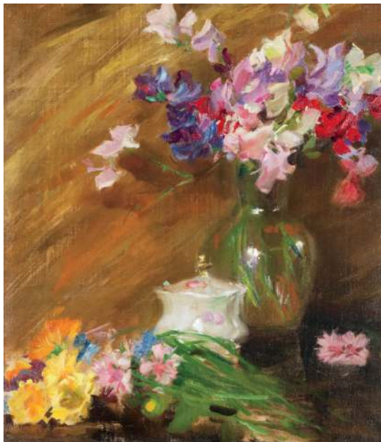
Irving Ramsay Wiles (1861–1948) Still Life with Bouquet and Sugar Bowl Oil on canvas 18 x 15 inches Retail price: $57,500 Special price: $37,500