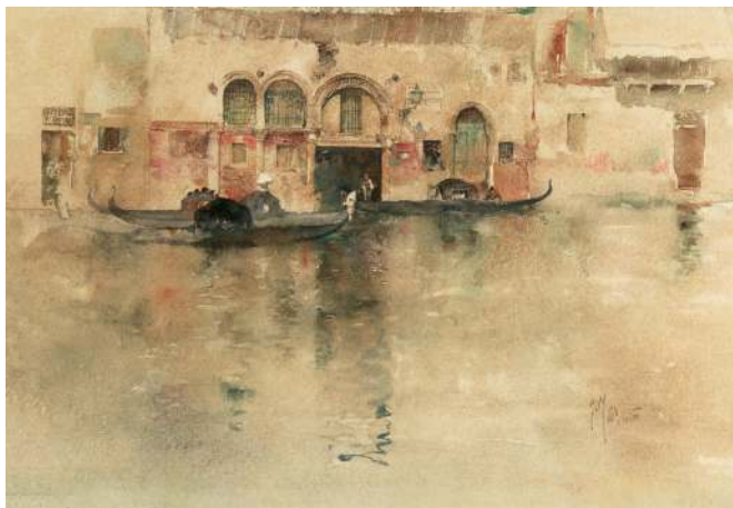
Robert Frederick Blum (1857–1903) The Traghetto, Venice , 1880

Watercolor, gouache, and pencil on paper