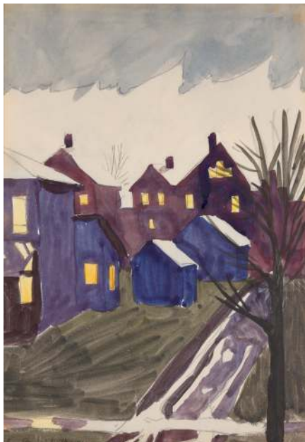
Charles Burchfield (1893–1967) Thawing Snow (or Wet Winter Dusk) , 1916 Watercolor and pencil on paper 13 3 / 8 x 9 3 / 8 inches (sight size) Signed and dated lower left: Chas Burchfield. 1916 Retail price: $30,000 Special price: $22,000