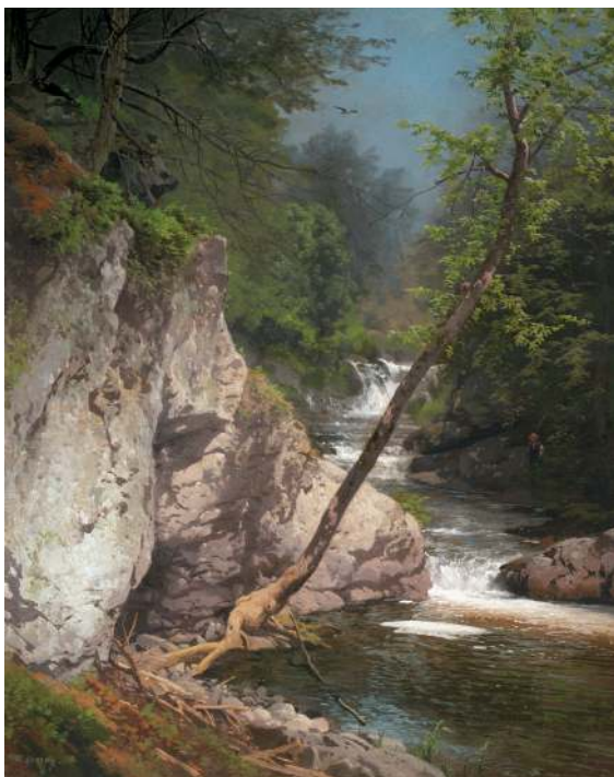
Hermann Herzog (1831–1932) Trout Fisherman Oil on canvas 26 5 / 8 x 21 5 / 8 inches Signed lower left: H. Herzog. Retail price: $32,500 Special price: $24,500