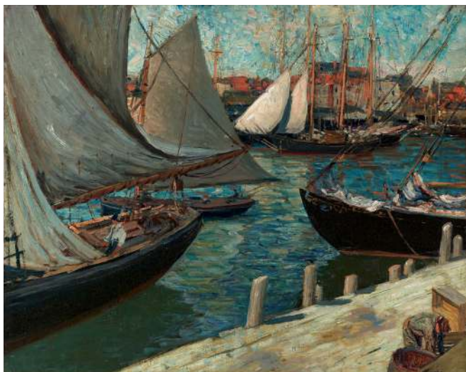
Frederick Judd Waugh (1861–1940) Gloucester Fishermen