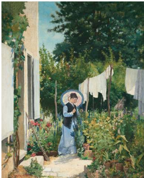
Will H. Low (1853–1932)