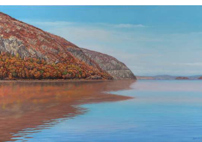
Tom Yost North Ridge, 2015 Oil on linen 20 x 30 inches Signed and dated lower right: Yost 15