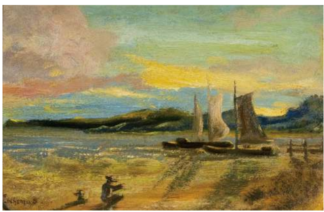
Louis Michel Eilshemius (1864–1941) Sails in Cuba

Oil on board 9<sup>7</sup>/<sub>8</sub> x 14<sup>15</sup>/<sub>16</sub> inches