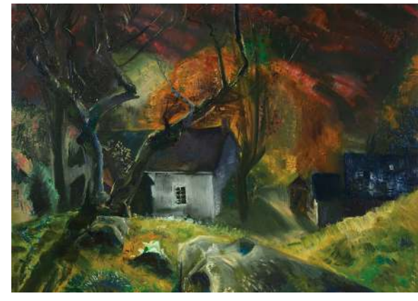
George Bellows (1882–1925) Little House in the Woods , 1920 Oil on panel