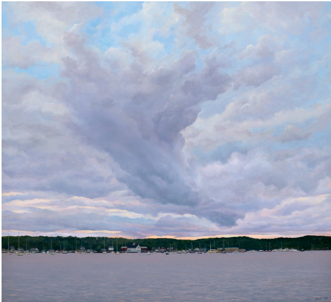
Essex Harbor, 2020 View from the Connecticut River Oil on linen 24 x 26 inches Signed and dated lower right: Yost '20 $25,000