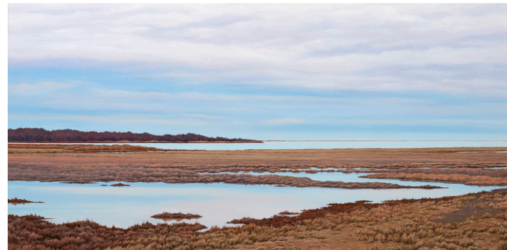
A Quiet Afternoon, Barn Island, 2019 Barn Island Wildlife Management Area Oil on linen 18 x 36 inches Signed and dated lower right: Yost '19 $24,000