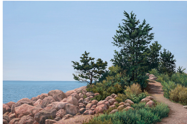
Shore Pines , 2019 Hammonasset Point Oil on linen 8 x 12 inches Signed and dated lower center: Yost '19 $8,500