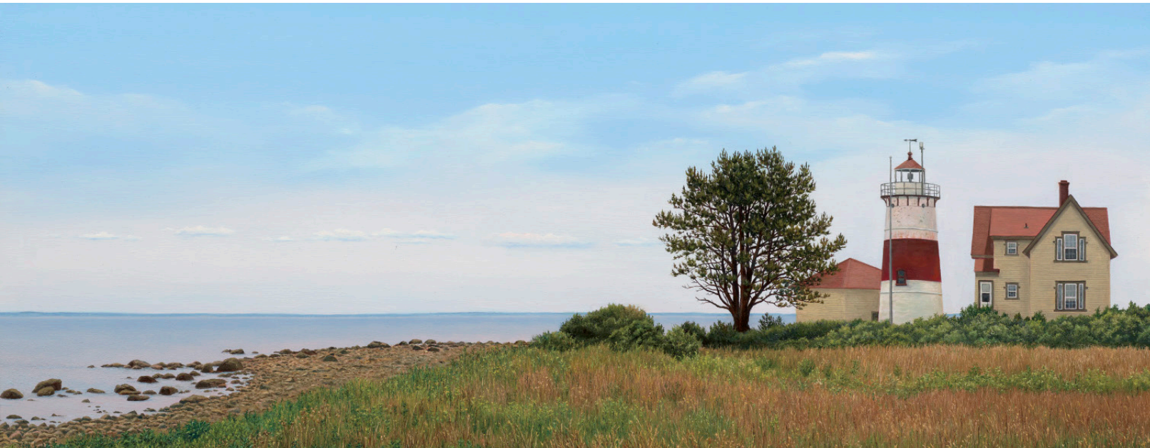
Stratford Point Lighthouse, 2020

View from Audubon Connecticut at Stratford Point