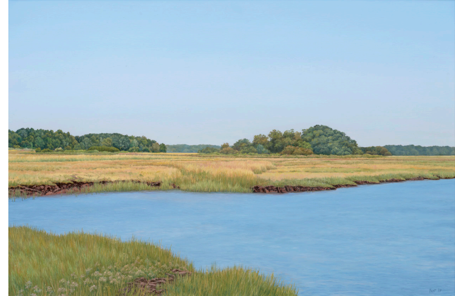
East River Marsh , 2019 Guilford Harbor Oil on linen 20 x 30 inches Signed and dated lower right: Yost '19 $22,000