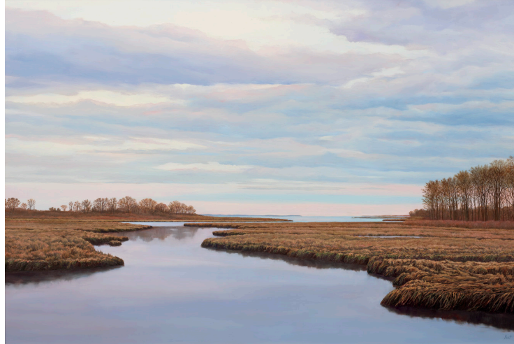
Marsh at Barn Island, 2018 Barn Island Wildlife Management Area Oil on linen 20 x 30 inches Signed and dated lower right: Yost '18 $29,000