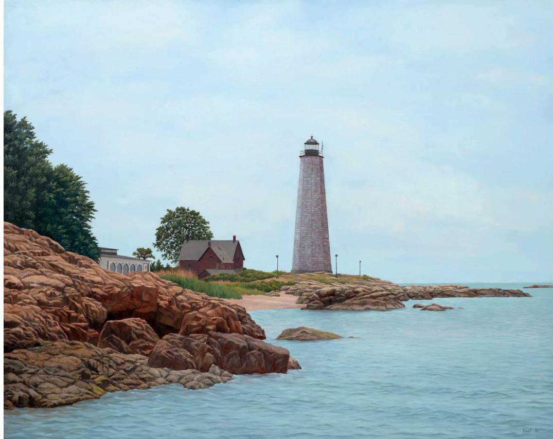
Five Mile Point Lighthouse , 2021 Lighthouse Point Park, New Haven Oil on linen 24 x 30 inches Signed and dated lower right: Yost '21