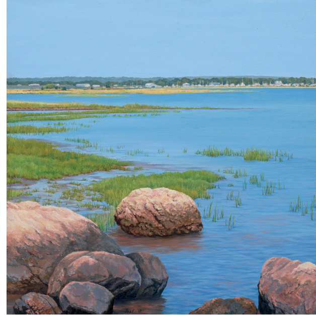
Clinton Harbor , 2019 View from Hammonasset Natural Preserve Area Oil on board 12 x 12 inches Signed and dated lower center: Yost '19 $14,000