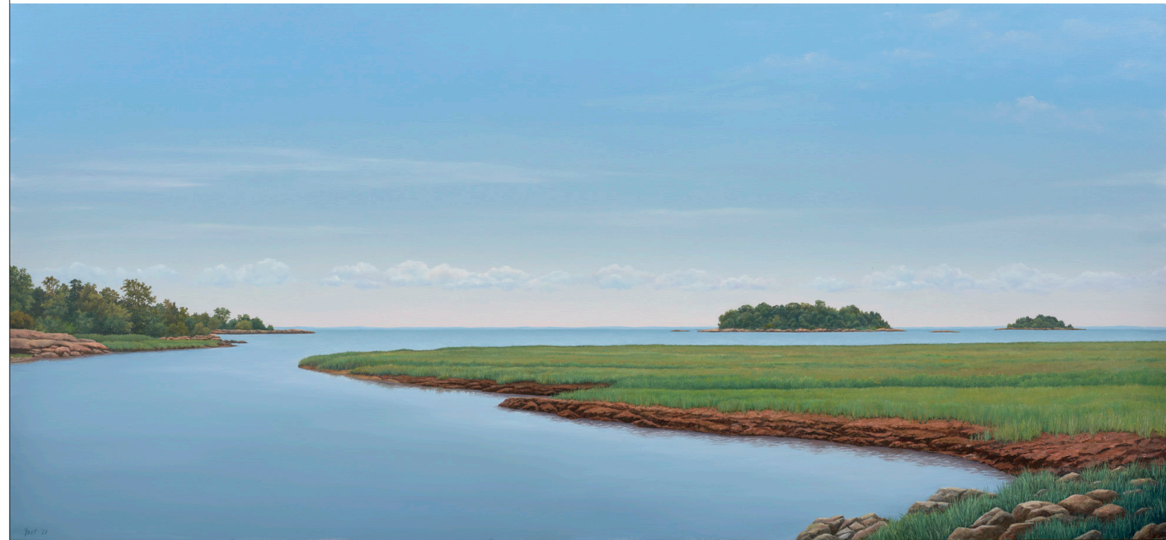
A Calm Day , 2020 View of Long Island Sound and the Thimble Islands from Jarvis Creek, Washburn Preserve, Branford Land Trust Oil on linen 24 x 52 inches Signed and dated lower left: Yost '20