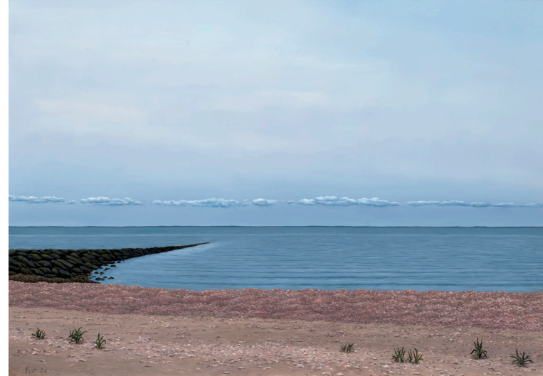
Breakwater, 2020 Long Beach, Stratford Oil on linen 14 x 20 inches Signed and dated lower left: Yost '20