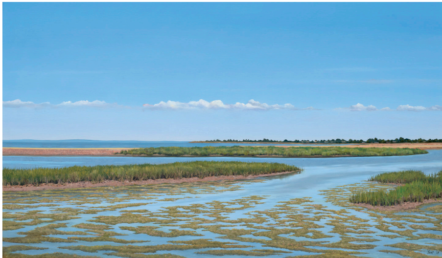
Marsh at Milford Point, 2018 View across Milford Point to Stratford Point Oil on linen 14 x 24 inches Signed and dated lower right: Yost '18 $18,000