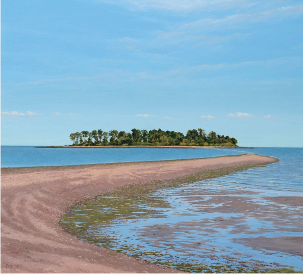
Charles Island, 2018 View from Silver Sands State Park, Milford Oil on linen 16 x 18 inches Signed and dated lower left: Yost '18 $17,000