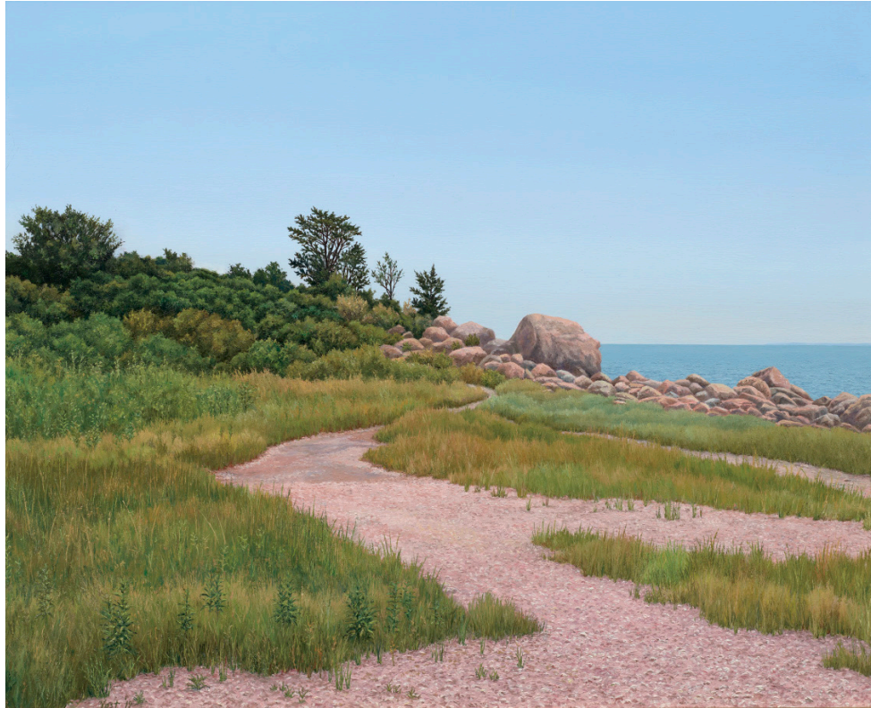
Shell Path , 2019 Near Hammonasset Point Oil on linen 16 x 20 inches Signed and dated lower left: Yost '19 $18,000