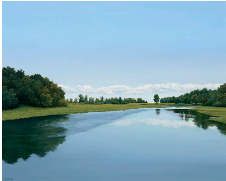
On the Way to Sherwood Island, 2020 Sherwood Island State Park Oil on linen 24 x 30 inches Signed and dated lower left: Yost '20 $28,000