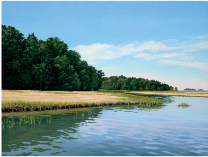
Hoadley Creek, 2020 Guilford Oil on linen 16 1 / 4 x 21 3 / 4 inches Signed and dated lower right: Yost '20 $23,000