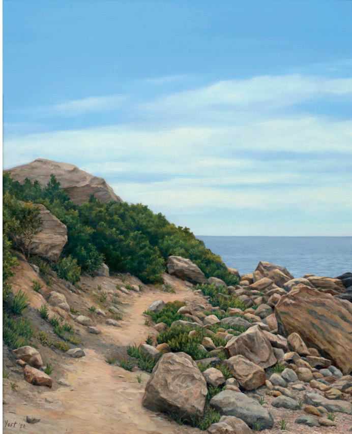
Shoreline Path , 2020 Hammonasset Point Oil on linen 17 x 14 inches Signed and dated lower left: Yost '20