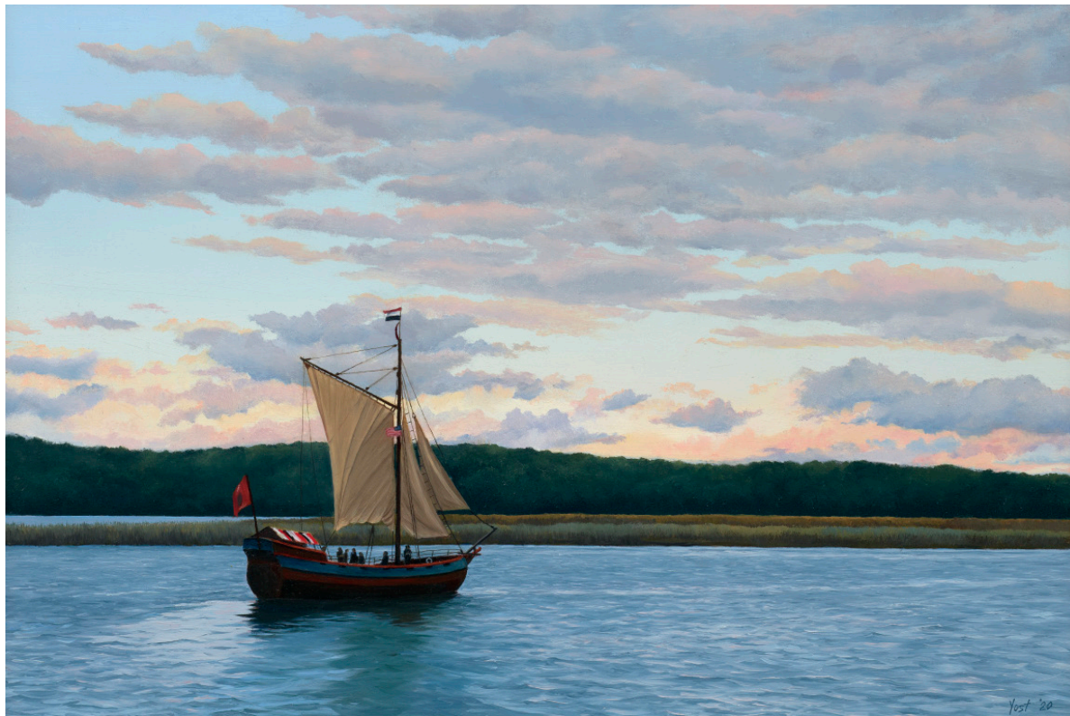
Sunset Cruise, 2020 The Onrust on the Connecticut River Oil on linen 12 x 18 inches Signed and dated lower right: Yost '20