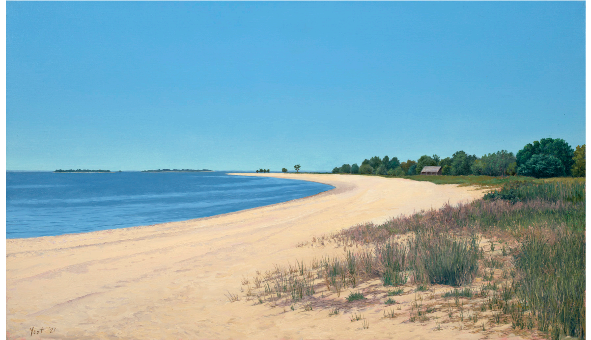
Alvord Beach, 2021 Sherwood Island State Park, Westport Oil on linen 11 1 / 2 x 19 1 / 2 inches Signed and dated lower right: Yost '21 $16,000