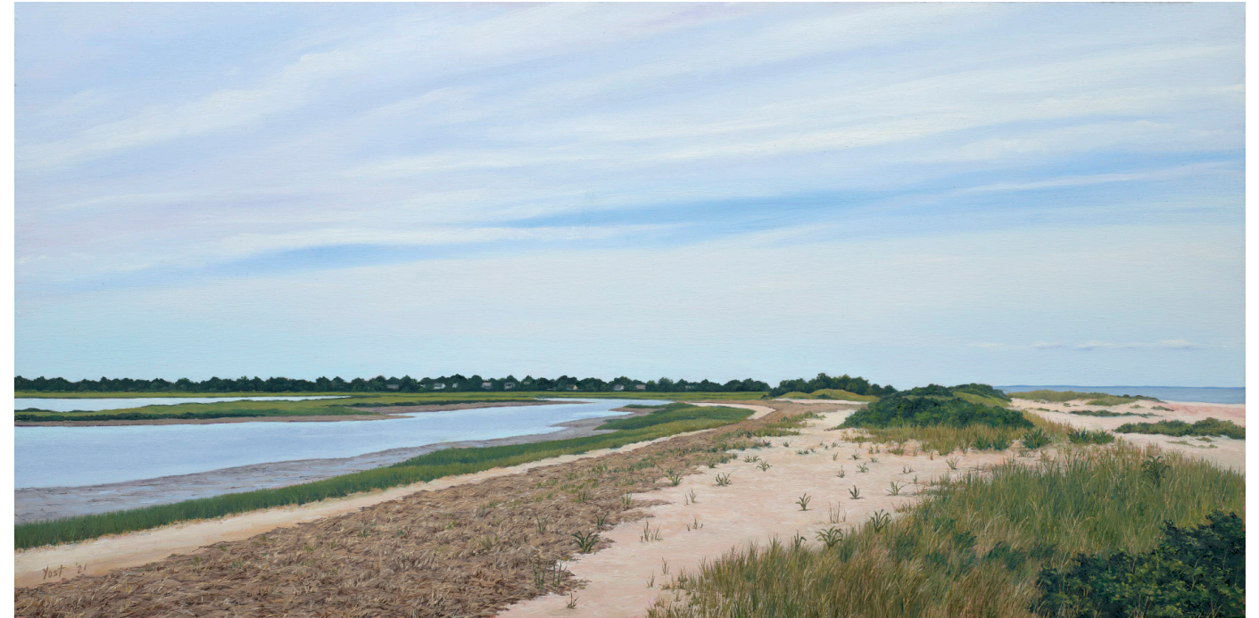
Long Beach, Looking East, 2021 Stratford Oil on linen 12 x 24 inches Signed and dated lower left: Yost '21 $18,000