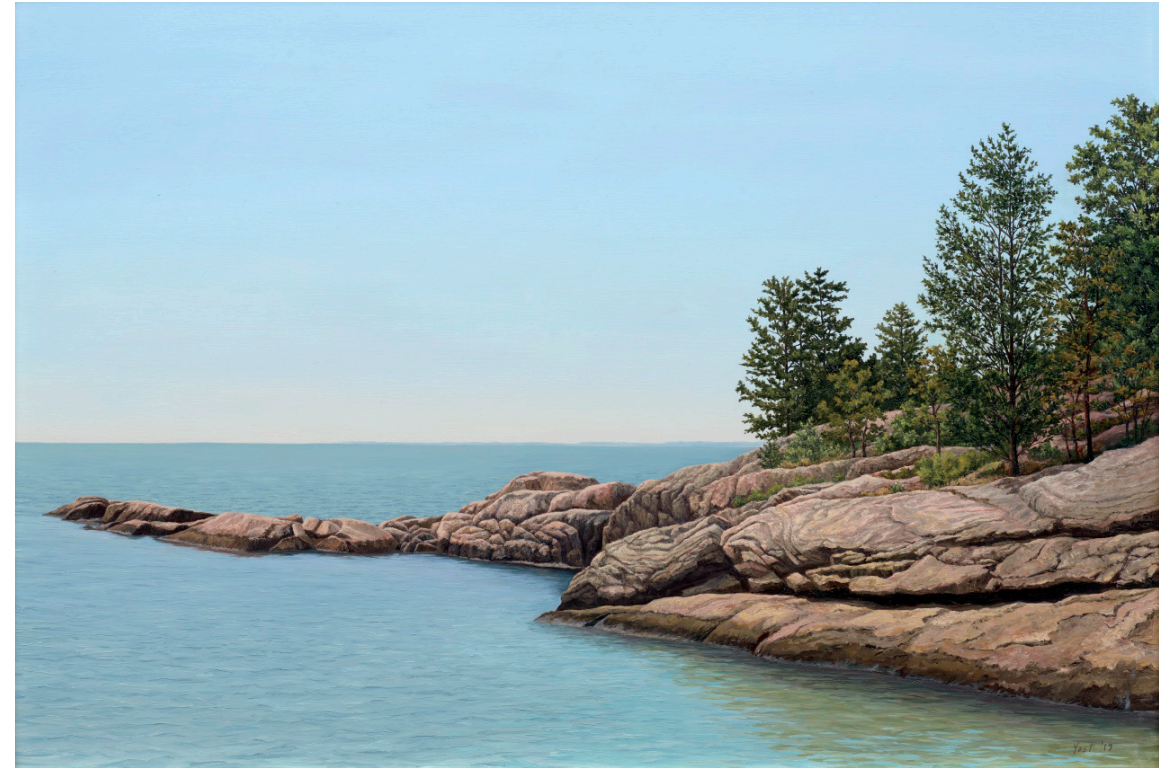
Rocky Neck , 2019 Rocky Neck State Park Oil on linen 16 x 24 inches Signed and dated lower right: Yost '19