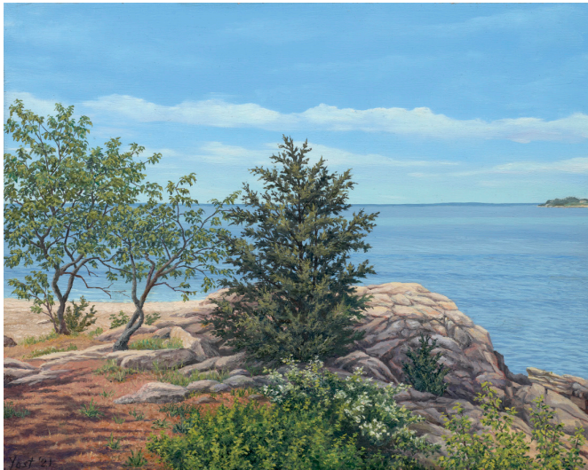
Weed Beach , 2021 Darien Oil on board 8 x 10 inches Signed and dated lower left: Yost '21