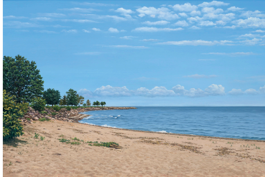
Cove at Sherwood Point , 2019 Sherwood Island State Park Oil on linen 12 x 18 inches Signed and dated lower left: Yost '19 $18,000