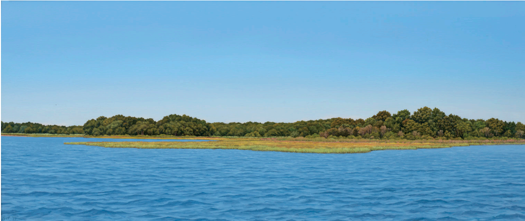
View of Barn Island , 2019 From Little Narragansett Bay Oil on linen 12 x 28 inches Signed and dated lower left: Yost '19