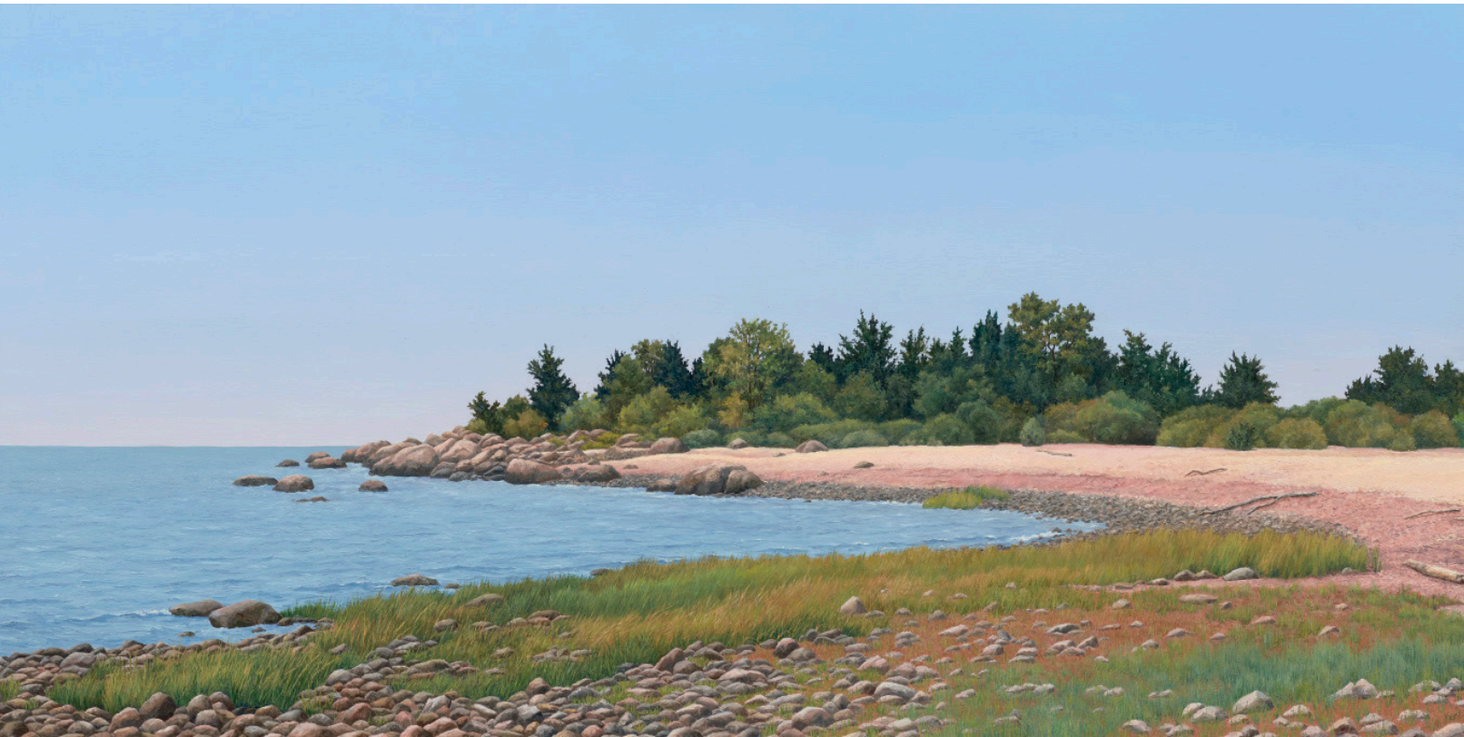
Cove at Hammonasset , 2020 Near Hammonasset Point Oil on linen 18 x 36 inches Signed and dated lower right: Yost '20 $26,000