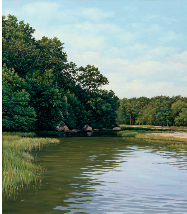
Cliffs Along Hoadley Creek , 2021 Guilford Oil on linen 16 x 14 inches Signed and dated lower left: Yost '21