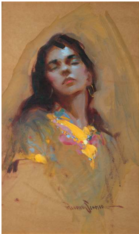
Richard Alan Schmid (b. 1934) Portrait Mixed media on board 15 13 / 16 x 9 13 / 16 inches (sight size) Signed lower right: RICHARD SCHMID —