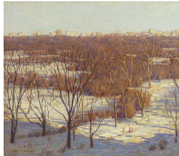
Paul Cornoyer (1864–1923) Central Park in Winter Oil on canvas laid down on board 13 3 / 4 x 16 inches Signed lower left: PAUL CORNOYER. ; on verso: Central Park in Winter