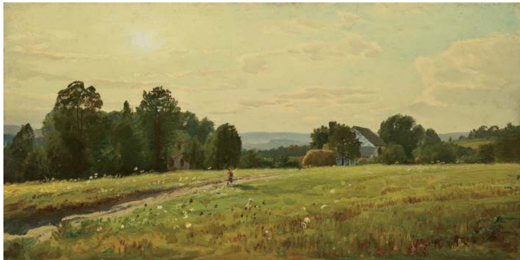
William Trost Richards (1833–1905) Chester County Oil on board 10 x 20 inches