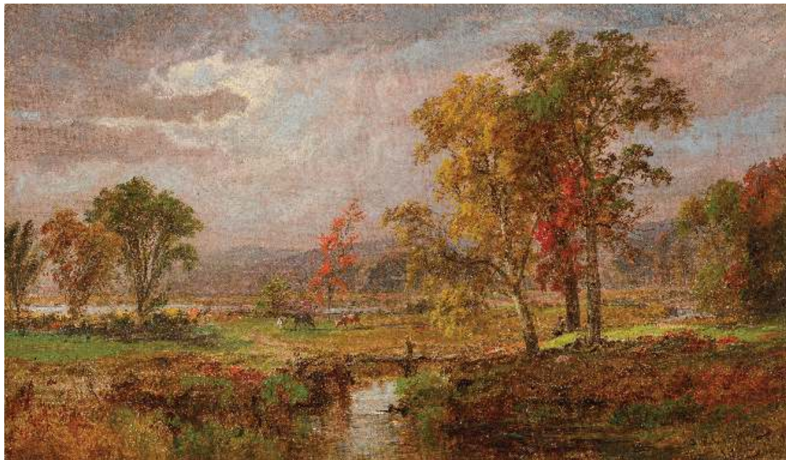
Jasper Francis Cropsey (1823–1900) Autumn Landscape , 1889 Oil on canvas 12 3 / 16 x 20 1 / 4 inches Signed and dated lower right: J. F. Cropsey / 1889