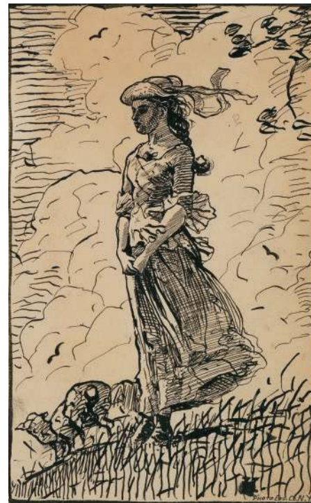
Winslow Homer (1836–1910) Fresh Air Ink on paper 7 15 / 16 x 4 15 / 16 inches Inscribed lower right: PHOTO ENG. CO. N.Y. ; on verso: “ Fresh Air ”—by Winslow Homer. / 14 x 20