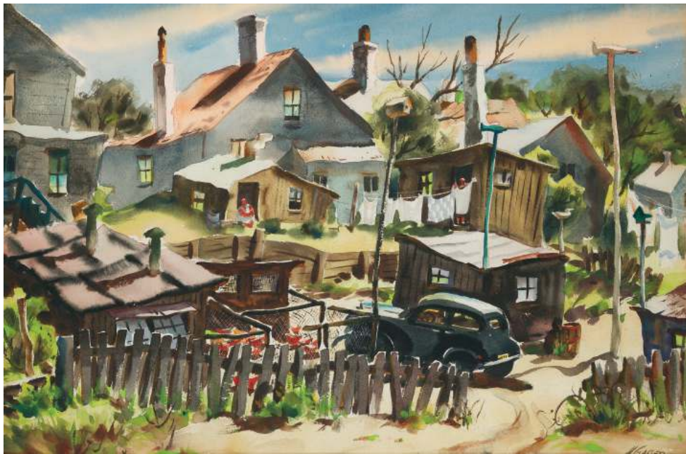
Henry Martin Gasser (1909–1981) Summer Yard Watercolor and pencil on paper 14 1 / 8 x 20 15 / 16 inches (sight size) Signed lower right: H. GASSER /; on verso: SUMMER YARD / HENRY GASSER